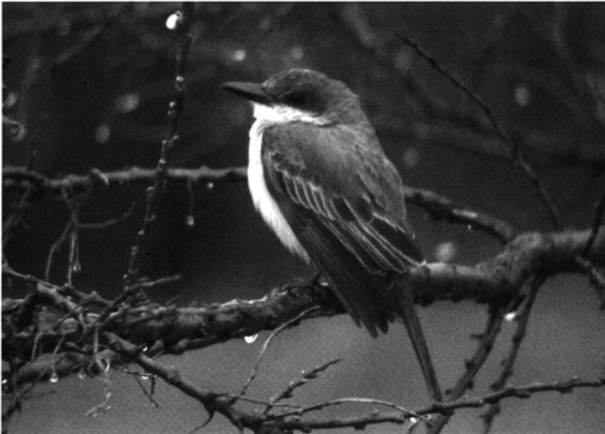
This adult Gray Kingbird, the first for Québec, spent 5-30 (here 9) November 2006 at L'Anse-à-Beaufils, near the tip of the Gaspé Peninsula. This individual fed mainly on the fruits of the Seabuckthorn ( Hippophae rhamnoides ).

per North Shore, the highest concentrations were attained farther ne. late in the season, with a daily maximum of 5 at Sept-Îles 11 Nov (BD, CC).