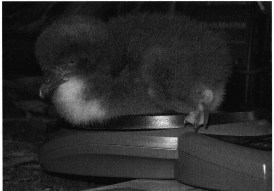
Newell's Shearwater is a Threatened species endemic to the Hawaiian Islands. Its populations are declining, largely due to predation by introduced mammals. This lucky Newell's chick (here 19 July 2006) hatched in an artificial nest burrow at Kilauea Point National Wildlife Refuge, where mammalian predators are controlled by the United States Fish & Wildlife Service.

Migrant shorebirds were typically scarce most of the summer. Two Semipalmated Plovers summering at Kii Jun+ were unusual (MS). At