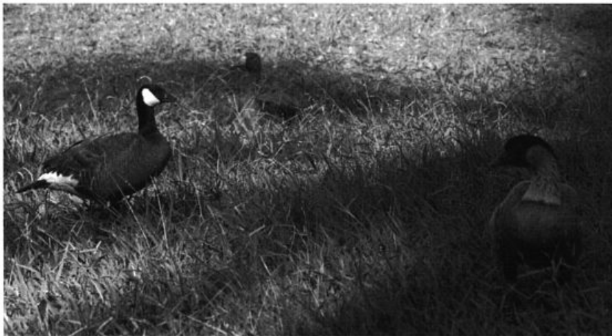
Migrant geese are uncommon in the Hawaiian Islands at any time of year and are especially rare in summer. This Cackling Goose (left) has remained with a flock of native Hawaiian Geese (right) at Kilauea Point National Wildlife Refuge since autumn 2004, while the Greater White-fronted Goose (center) has been with the flock since autumn 2005. These geese were photographed 24 August 2006, when the two migrants were molting.