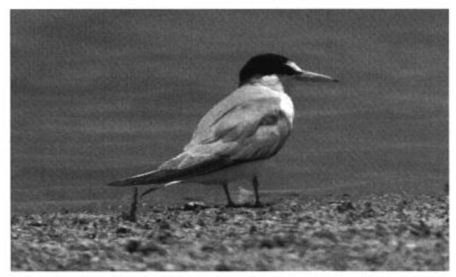
One of at least eight Least Terms present around the south end of the Salton Sea, Imperial County, California through the summer, this individual was photographed on 22 June 2006.

introduced Spotted Dove are crashing, it was a surprise to find a pair with 2 recently fledged young in Niland 21 May (GMcC), establishing the first breeding record for Imperial. Single White-winged Doves were found along the coast on Point Loma, San Diego 17 Jul (PU) and in Carson, Los Angeles 30 Jul (KGL), where rare, and another in Independence, Inyo 20 Jul (RAH) was n. of the species' normal range. A Ruddy Ground-Dove near El Centro, Imperial 30 Jul+ (KZK) was the only one found away from the small resident population near Calipatria, Imperial. Single Yellow-billed Cuckoos along San Felipe Cr. in e. San Diego 24 Jun-8 Jul (PJ) and on the San Luis Rey R. near Oceanside, San Diego 3 Aug (KF) were in suitable breeding habitat, but one in El Centro 18 Jun (BK) was a late spring migrant in an area where few have been recorded.