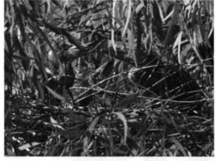
These three young Yellow-crowned Night-Herons with one of the adults (partly visible; upper right) left this nest in Imperial Beach, San Diego County, in July 2006 (here 14 June), establishing the first record for nesting in California.

likely summering locally, while the date of another at S.C.R.E. 29 Jul (BJ) coincides with the arrival of the first of the fall migrants off-