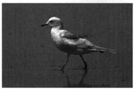
This summering immature Mew Gull, photographed at Cayucos, San Luis Obispo County, California 17 June 2006, shows the worn and bleached flight feathers on the wings typically present on northern gulls summering in southern California.