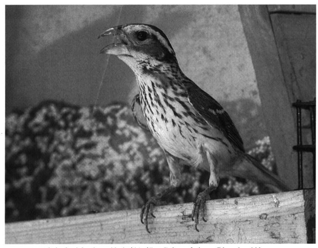
This lost female Rose-breasted Grosbeak joined House Finches at a feeder near El Centro, Imperial County, California on 8 July 2006 but was gone the following day.

MTH); a pair was also at the traditional site at Arrastre Cr. in the San Bernardino Mts. (AEK). A nesting pair of Summer Tanagers in Jacumba through the period (EK, MUE) extended this species' limited breeding range in San Diego . A singing male Western Tanager in Huntington Beach 16-20 Jun (DC, BED) was well away from nesting habitat.