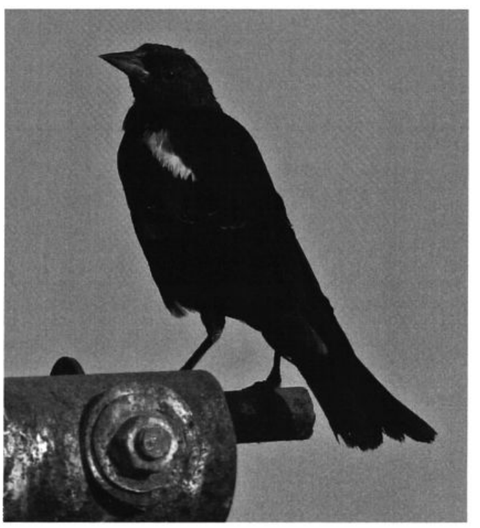
This adult male Tricolored Blackbird was one of six found with other blackbirds at a dairy near Seeley, Imperial County, California in July (here 30 July) 2006, well outside the species' known range.

An emaciated Arctic Loon captured in Newport Beach, Orange 5 Jul (KLG; *LACM) provides the 5th record for California. A Common Loon at S.E.S.S. 17 Jun (GMcC) and another at N.E.S.S. 30 Jun–1 Jul (SB) were either very late spring migrants or attempting to summer locally. An exciting concentration of "pelagics" visible from the Newport Beach pier in late Jul produced counts of 300 Pink-footed, 560 Sooty, and 400 Black-