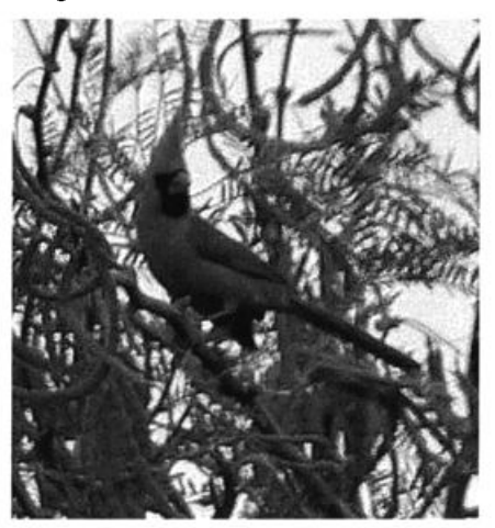
This male Northern Cardinal in Blythe, Riverside County, California, photographed on the second day of its known 6-8 June 2006 stay, was at the extreme western edge of the species' range in the Southwest, and possibly the only one on the California side of the Colorado River.