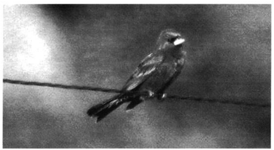
This Blue Grosbeak southeast of Bridger, Montana 24 June 2006 was later joined by a female and the pair remained through July—only the fourth record for Montana.