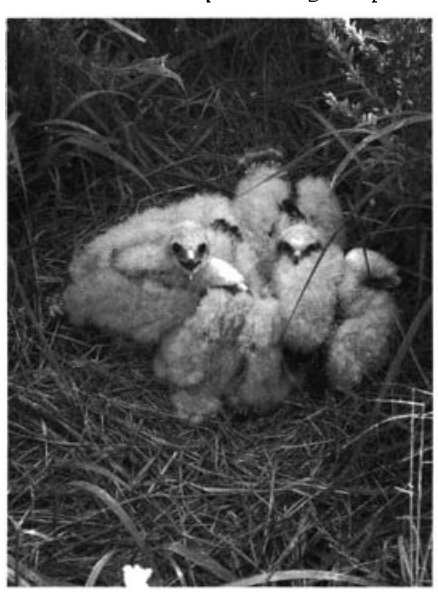
This Northern Harrier nest (8 June 2006) represented a first breeding record for Hopkins County, Kentucky. The species is locally distributed as a breeder in the westerncentral part of the state, mostly on reclaimed mine land.