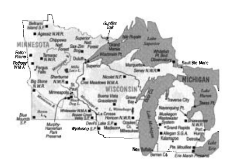
Peder H. Svingen

ost of the Region received belownormal precipitation. Good habitat for shorebirds was found in western Minnesota and along the Lake Michigan shoreline of the Upper Peninsula.