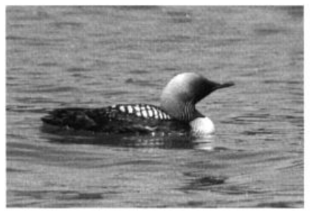
A rarity in Indiana at any season, this Pacific Loon remained at Raccoon State Recreation Area for close to a month, early June through 8 (here 1) July 2006, allowing scores of birders to see it; there is only one previous summer record of the species for the state.

Two Piping Plovers (one banded) were at Miller 21 Jul (MT), and another banded bird was there 25-26 Jul (MT, JKC, KJB). Three were reported in Illinois, highlighted by a color-banded bird seen 1 Aug at Great Lakes Naval Training Center, Lake (DRD). It was a spectacular season in Indiana for Black-necked Stilts, with nine nests recorded 13 Jun at Cane Ridge W.M.A., Gibson (WM, RD, KH, CM), where the single-day high count was of 20 birds 29 Jul (DG). At least four successful pairs were also noted at G.P.F.W.A. (LWS), where the high count was of 17 birds 30 Jul (LWS, JWL). The only Black-necked Stilts reported in Illi-