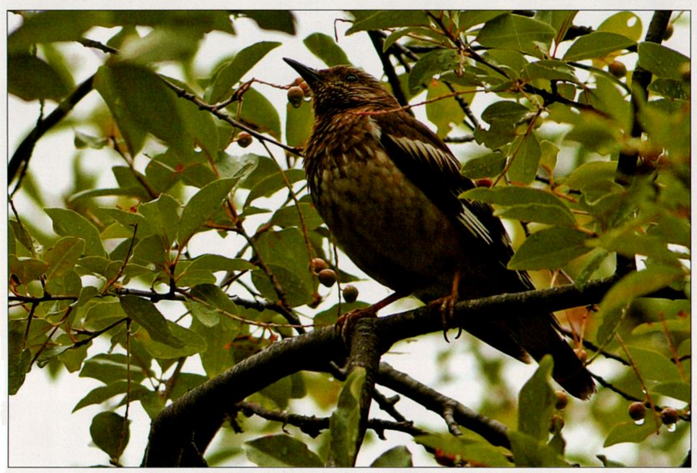
During the second-largest flight of Aztec Thrushes recorded in the United States, this bird was one of three seen at Madera Canyon, Arizona 27 July 2006, and nine had been counted here the day before.

When colleagues and friends return from their Alaskan travels in late June, I relish hearing the tales of birding and socializing, of encounters with big mammals, of heavy low-pressure systems that bring bounties of Siberian birds. In recent years, weather tales have been less than legendary: warmer weather has been the norm, with few big lows moving over from Asia, open seas with little ice, and record-early arrival by nesting species. The signs of global warm-up have seemed to strengthen each spring, at least over the past six years.