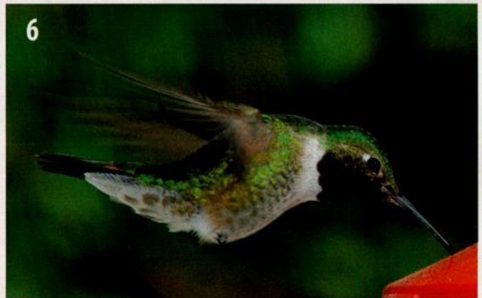
6 • This male Broad-tailed Hummingbird at a feeder in Portage la Prairie, Manitoba 16 (here 17) through at least 29 May 2006 was a first for the Prairie Provinces region and attracted birders from far and wide. The same feeder had hosted a Rufous Hummingbird in September 2004.