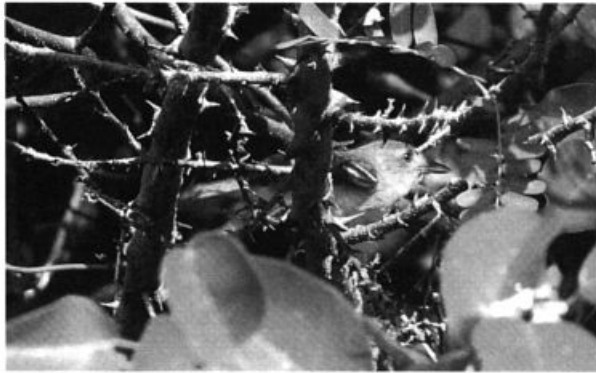
At least 3 Mangrove Vireos were found 8 April 2006 near the research station at Pantanos de Centla biosphere reserve, Tabasco (about 15 km south of Frontera).

A Tody Motmot was at Bonampak ruins 3 May (AM, JM), and 2 called above Valle Nacional 3 May, along with a Rufous-tailed Jacamar (MG). Two Rufous-tailed Jacamars