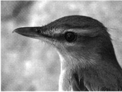
This Yellow-green Vireo mist-netted in the Santo Domingo botanical garden in downtown Oaxaca City 23 April 2006 was completely unexpected in the central valleys of Oaxaca.