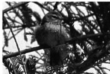
This Palm Warbler was present at Parque Ecológico Xochimilco in Mexico City 18 (here) through 27 April 2006 and was the first record for the Distrito Federal, where the bird list tops 340 species.