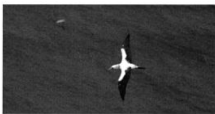
This booby at Farallón de San Ignacio, Sinaloa, Mexico (here 16 May 2006) tended a chick with a female Brown Booby. Its features are consistent with Masked Booby x Brown Booby hybrid, a combination that has been reported previously.

Several Little Tinamous heard 6 Apr on the Pue. side of the Río Tonto were outside of known range (AM, JM). Three Muscovy Ducks were seen 19-20 May near Peña Blanca, and a pair was on the Río Uxpanapa near Cerro Nanchital 30 May (AM, JM). A pair of Long-tailed Wood-Partridge was seen on the fire tower road at La Cima, D.F. 9 Mar (HGdS) and 29 Apr (MC). A pair of ad. Bearded Wood-Partridges with 3 tawny-buff