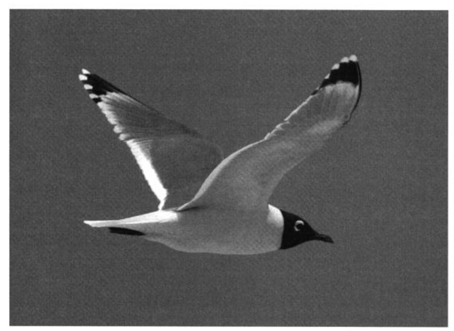
At Estero San José del Cabo, Baja California Sur, this adult Franklin's Gull was one of three or four reported in the general area on 19 May 2006.