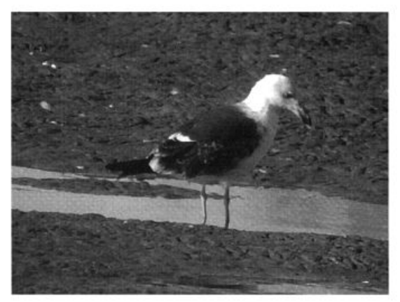
Washington's sixth Lesser Black-backed Gull, photographed here at Moses Lake, Grant County on 12 March 2006, remained until 18 March. The state's first record was documented only in January 2000.