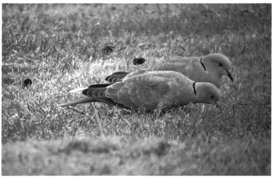
In spring 2006, Eurasian Collared-Doves escalated their movement into the Pacific Northwest dramatically, with no fewer than 48 found in Oregon and Washington, mostly east of the Cascade Mountains. A year ago, Oregon and Washington had about 30 records combined. These particular collared-doves were the only ones found in western Washington, inhabiting Point No Point, Kitsap County, 12-15 (here 15) May 2006.