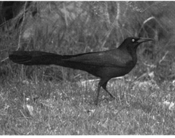
Washington's fourth Great-tailed Grackle returned to Liberty Lake, Spokane County 30 March 2006 (here 14 April); it has appeared intermittently there since approximately 1 January 2004.

The Region's first spring Broad-winged Hawks since 2000 were seen at Malheur 27