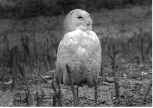
Snowy Owls lingered after this winter's irruption as never before, with seven in Washington lasting into May and this bird, Oregon's latest ever by more than a month, near Umapine, Umatilla County on 24 May 2006.

At least 39 Snowy Owls were found this spring, split nearly evenly east/west, including an amazing 7 lingering into May, about two months later than normal. The latest eastside Snowies were near Waterville, Douglas 23–30