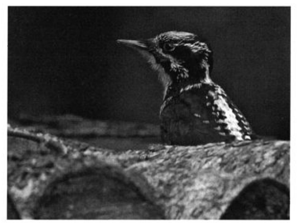
This American Three-toed Woodpecker at Wauconda, Okanogan County, on 23 May 2006 appears to be, at least in part, of the subspecies dorsalis . Only P. d. fas ciatus had been known to occur in Washington/Oregon, and Washington's birds were assumed to be among the darkest members of that subspecies. Note, however, the unmarked center of this bird's back and its resemblance to the bird on the front cover of North American Birds 49 (4).

Tallies of 55 Red Knots at Tillamook 7 May (WG) and 40 in Lane/Lincoln 30 Apr (DI) su-