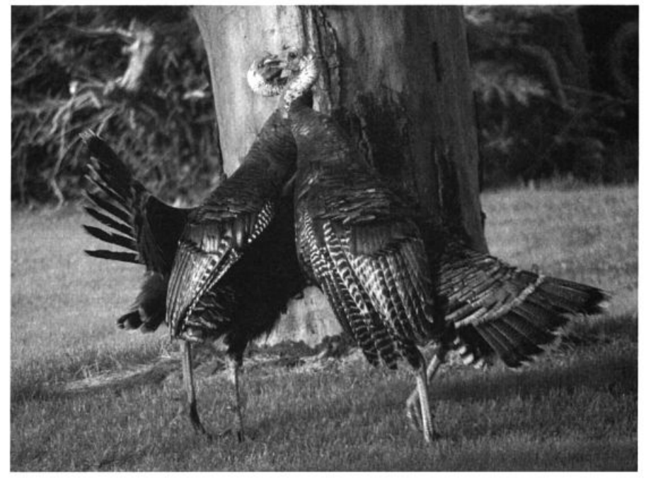
Populations of Wild Turkey in southeastern Washington and northeastern Oregon seem to be exploding. On 30 November 2002, a record-high 310 were found along Upper Dry Creek, Umatilla County, Oregon, and as of September 2005, the species had established itself in Franklin County, Washington at Lyons Ferry. These two males, in company of six females (here 28 May 2006), apparently first arrived at Washtucna last fall, furnishing a first record for Washington's Adams County.