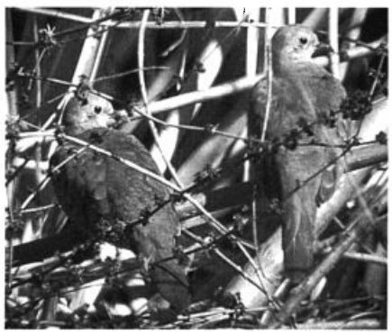
Ruddy Ground-Dove has occurred annually in New Mexico since 2002. This pair was near Mesilla, Doña Ana County 2-5 (here 4) March 2006.