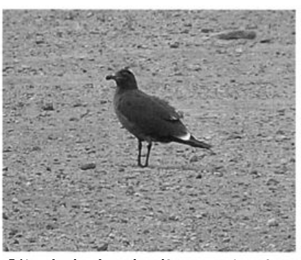
Taking a break at the eastbound I-10 rest area in southern Grant County 28 March 2006, this Heermann's Gull provided New Mexico's sixth record.