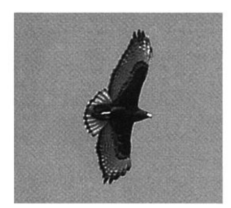
Although reported almost annually in New Mexico, Harlan's Hawk is rarely well documented in the state. This one was near Mesilla, Doña Ana County 4 March 2006.