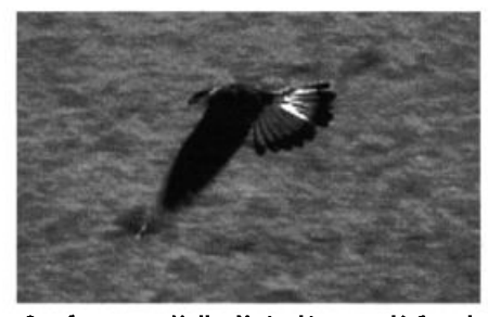
One of two reported in New Mexico this season, this Crested Caracara frequented a field at San Acacia, Socorro County 15-16 (here 16) April 2006. There are now about a dozen credible reports for the state.

Northern Cardinals continued to appear n of historic range, including single males at Silver City 7 May (ph. DZ), Albuquerque's South Valley 4 May (DH), and Corrales 7 May (CR); singles were at Tucumcari 17 Apr (BO) and 28 May (CR), and 2 were on Pajarito Cr