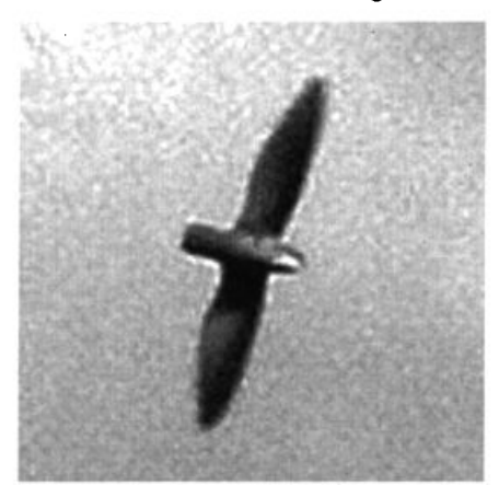
Although Vaux's Swift almost certainly migrates through southwestern New Mexico, verification has proven elusive. It is hoped the multiple photographs and videotape of two seen and heard at Percha State Park, Sierra County 24 (here) and 25 April 2006 will finally prove definitive.

(NP, MB). Early were single Swainson's Thrushes at Pep 29 Apr (JB), R.S. 29-30 Apr (D. Krueper), and Corrales 30 Apr (BV). A Wood Thrush at the Conchas L. golf course