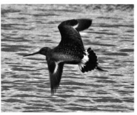
An exceptional shorebird gathering at Table Mountain Wildlife Habitat Management Area, Goshen County, Wyoming 16 May 2006 included this Hudsonian Godwit.