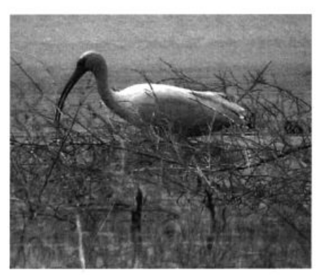
Colorado's fifth (and probably most cooperative) White Ibis loitered near the Red Lion State Wildlife Area, Logan County, Colorado 10-15 (here 15) April 2006.