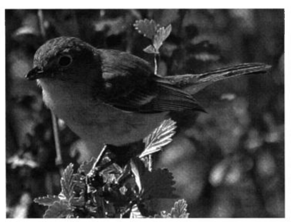
This Gray Vireo was one of two present at Little Firehole, Sweetwater County, Wyoming on 29 May 2006; this photorgraph represents the first firm evidence of the species in the state.