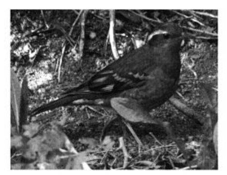
The hip-pocket vagrant trap at Last Chance, Washington County, Colorado can be well worth the detour: among the noteworthy birds found there this season were two Varied Thrushes, including this female on 12 May 2006.

can be assumed to be in Colorado except that each Wyoming location is noted as such the first time it appears in the text.