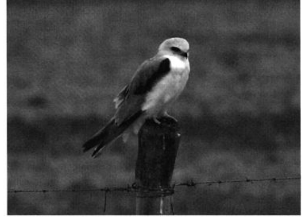
In recent years, White-tailed Kites have been documented in many unexpected locations across Texas. This individual near Wayside, Armstrong County was found on 28 April 2006 and represents the first to be documented in the Panhandle.