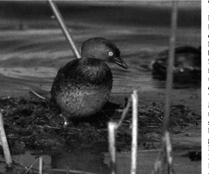
Least Grebes are expanding their range up the Texas coast, and recently there have been a few documented nesting attempts on the Upper Coast. In spring 2006, a pair nested unsuccessfully at Pearland, Brazoria County (here 22 April).