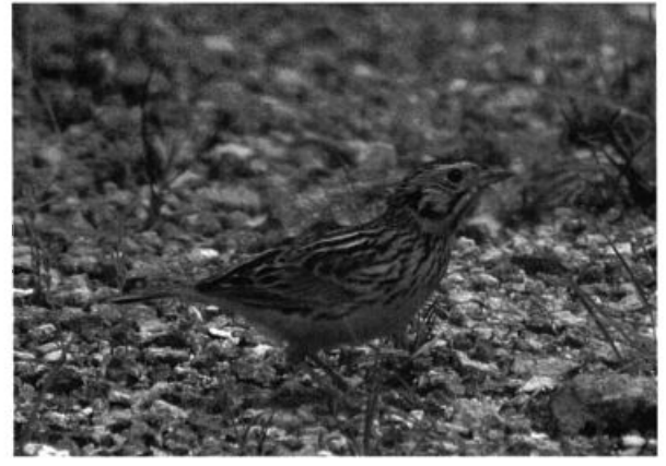
The migration route of Baird's Sparrows appeared to be pushed slightly eastward this season. Three individuals were documented in the central portion of the state, including this bird that was at Austin, Travis County on 21 April 2006. It provided the first record for the Hill Country, which was quickly followed the next day by another in nearby Burnet County.