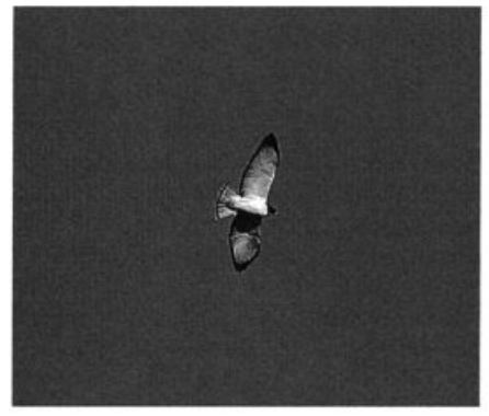
Short-tailed Hawk was first documented in Texas in 1988, but there are now nearly 30 state records. This light-morph adult in the Davis Mountains from 23 April (here) through 5 May 2006 provided the second record for the Trans-Pecos.