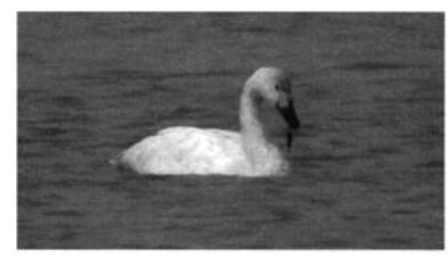
A subspecies considered casual in Montana, this Bewick's Swan was with Tundra Swans at Freezeout Lake, Montana 28 March 2006.

Marking the first report for North Dakota in 70 years, a Mountain Plover was videotaped 9 Apr at a Greater Sage-Grouse lek in Slope (p.a., AVN). Four Mountain Plovers were s. of Glasgow, MT 21 Apr (JC). The earliest for South Dakota, a Willet was in Beadle 7 Apr (BFW), and a Marbled Godwit was in Hand 31 Mar (BFW). A very rare migrant in South Dakota, 2 Red Knots were in Kingsbury 20 May (JSP, RFS). Also very rare in South Dakota, a Western Sandpiper was noted in Sully 14 May (RDO). Stilt Sandpipers were early 9 Apr in Union, SD (BFH) and 16 Apr in Burleigh, ND (HCT). American Woodcocks were displaying again this spring in Burleigh, ND. Nesting has not been confirmed in the area (HCT, CDE, BB).