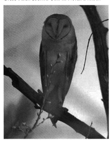
Barn Owl sightings are on the rise in the Northern Great Plains. This bird was a good find in Dunn County, North Dakota 1 May 2006.

The season provided a good number of vagrants and casual species in North Dakota. Possible first state records included an Anhinga in North Dakota, Great Black-backed Gull in South Dakota, and Smew and Blue-winged Warbler in Montana. Second state sightings were a Yellow-throated Vireo in Montana and Great Black-backed Gull in North Dakota.