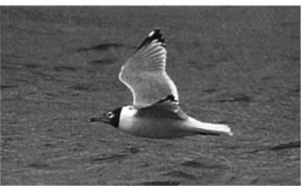
This possible Franklin's Gull × Ring-billed Gull hybrid was in Pierre, South Dakota 30 and (here) 31 March 2006.

other species usually reported only in the summer season in North Dakota, Dickcissel was widely reported in the state by late May. Casual in North Dakota, an Eastern Meadowlark was in Ransom 29 Mar (BS). A European Goldfinch, surely an escapee, was photographed 7 May in Burleigh, ND (AN). There were only two reports of Red Crossbill from North Dakota, and no White-winged Crossbills were noted.