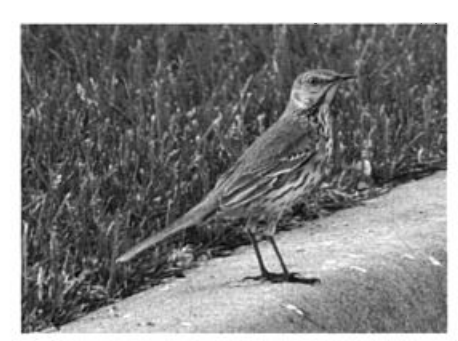
Furnishing about the eleventh record for North Dakota, this Sage Thrasher in Fargo 21 May 2006 was one of two reported in the state in the spring season.