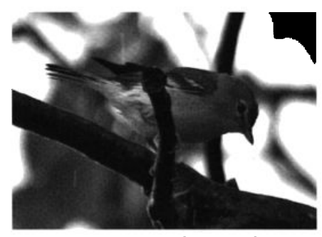
Representing the second record for Montana, this Yellowthroated Vireo was at Bowdoin National Wildlife Refuge 27 28 (here 27) May 2006.