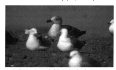
This first-year Great Black-backed Gull at the Bismarck, North Dakota Landfill 8 April 2006 provided the second record for the state. Another individual of this species was found later the same day in an adjacent county.