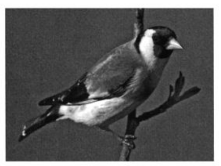
This exotic European Goldfinch was a one-day wonder in Burleigh County, North Dakota 7 May 2006.

heels of the first state record last spring, 2 Great Black-backed Gulls were noted in North Dakota. Singles were photographed in Burleigh and Logan 8 Apr (p.a., REM, CDE, HCT). A potential first for South Dakota, a Great Black-backed Gull was in Sully 8-9 Apr (p.a., RDO, KM). The earliest record for South Dakota, a Caspian Tern was in Hughes 14 Apr (KM)