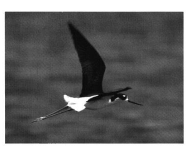
This male Black-necked Stilt was first found on 23 (here 26) May 2006 at Whitewater Lake, Manitoba. On 24 May, a female was discovered on a nearby nest, which later produced at least three young. This represents the first confirmed breeding of the species in the province.

New locations for Eurasian Collared-Doves were Crystal City, MB (ph. BTr), Winkler, MB (LBr), and Grenfell, SK (DC). A Yellow-billed Cuckoo at Assiniboine Park, Winnipeg 27-28 May was seen by many (BCa, m.ob., ph.). Snowy Owls lingered well into spring, with singles reported as late as 15 May near Regina (BLu, SW) and 21 May at Oak Hammock (GB). A Chimney Swift battling fierce headwinds at Robsart, SK 23 May and 4 the next day at Estevan, SK were well w. of their usual range (AC, LdM, RKo).