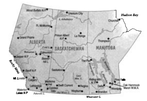
Rudolf F. Koes | Peter Taylor

Temperatures in March and April ranged from cool in the west (Alberta) to well above normal in the east (Manitoba). Accordingly, nesting activity for waterfowl was delayed in the west but early in the east. In the latter province, trees leafed out weeks ahead of schedule. Regionwide, observers lamented the general lack of migrants, with shorebirds, flycatchers, vireos, Catharus thrushes, and Zonotrichia sparrows being particularly scarce. It was thought (or hoped!) that placid weather conditions allowed the birds to fly over, without having to drop in at traditional stopover areas.