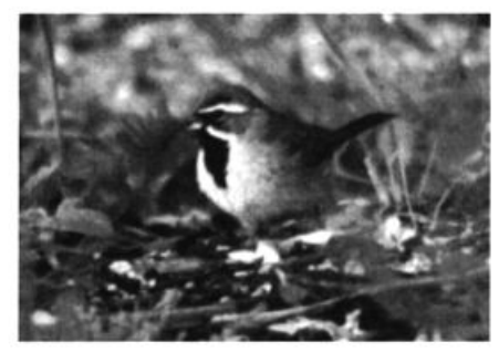
Alberta's second Black-throated Sparrow visited a Bearspaw yard 28 and 29 May (here) 2006. It appeared following four days of weather disturbances moving up to the province from the American Southwest.

was rare (B&HSc). Calgary, AB hosted a smorgasbord of rare gulls: an Iceland Gull 29-30 Mar (RW, m.ob.), a Lesser Black-backed Gull 28-30 Mar (RB, RS), a Slaty-backed Gull 28-30 Mar (BCl, ET, MM, m.ob.), a Western Gull 4 Apr (potentially a Regional first) (TK, m.ob., ph.), and a Glaucous-winged Gull 8 May (RW). Elsewhere, a Lesser Black-backed Gull was at Wascana 6-12 Apr (BLu, m.ob.), a possible Herring Gull × Glaucous-winged Gull hybrid was at the PR 227 dump in s. Manitoba 17 May (PT, RKo, ph.), and a Glaucous-winged Gull was at Edmonton, AB 1