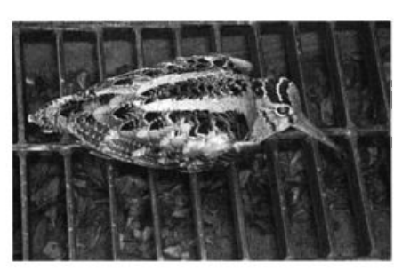
This American Woodcock at Redcliff, near Medicine Hat, Alberta 7 April 2006, was nearly 1000 kilometers west of its normal range. Representing the first confirmed record for the province, it departed when a television cameraman prodded it to see if it was alive!