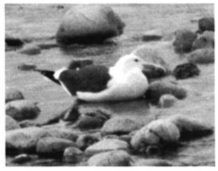
In a season that saw many rare gulls in Alberta, this Western Gull at Calgary on 4 April 2006 may have been the rarest. The identification was based on the overall heavy build, the heavy bill, dark eyes, large domed head, and drooping "skirt." If accepted, it would be a first for the Prairie Provinces.