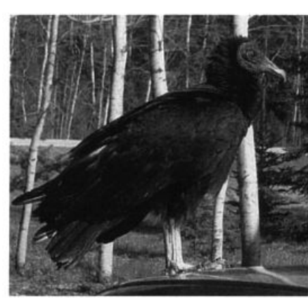
This Black Vulture, photographed at Wanless, in westerncentral Manitoba, 11 May 2006, furnished a first record for the province.

Snow and Ross's Geese were almost completely absent in se. Manitoba, reflecting a major westward shift in their migration path during the past few years. Up to 5 Trumpeter Swans were in the Pinawa, MB vicinity 6-30 May (PT, m.ob.). There were 12+ reports of Eurasian Wigeon in Alberta, involving 16 birds, 24 Mar-10 May (TK, DK, m.ob.). Farther e., 3 were at Wascana 5 Apr (SW, BE) and one near Regina 12 Apr (GK), while a Eurasian Wigeon × American Wigeon hybrid was near Stavely, AB 29 Apr (TK). A Common Loon at Gull L., MB 4 Apr was very early (AE, PF, RN, JP). A Great Egret strayed to Wascana 11 Apr (JC, m.ob.). Manitoba hosted 5 Snowy Egrets, including a northerly bird near The Pas 25 May (BPi, EB, ph.). A Little Blue Heron was at Whitewater 31 May (KD), and Cattle Egret numbers at this hotspot had climbed to 47 by 25 May (AC, LdM, RKo). Notable at Ft.