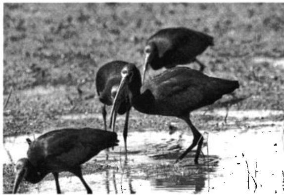
As many as four White-faced Ibis were at Huntley Meadows Park, Fairfax County, Virginia 17-23 (here 19) April 2006, keeping company with one or two Glossy Ibis.