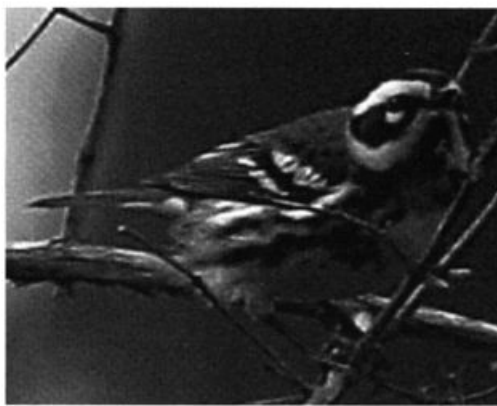
A Townsend's Warbler found 10 March 2006 (here) at Sycamore Landing, Montgomery County, Maryland was 24 kilometers from a Frederick County site that had held a Townsend's two months earlier—thus almost certainly a different individual.