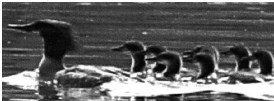
This Common Merganser family group, including eight ducklings, was observed at Violette's Lock, Montgomery County, Maryland 23 May (here) through 14 June 2006; more were observed along the Potomac River throughout the summer, including in the District of Columbia.

Spring 2006 held little to distinguish itself in the way of weather patterns, bird records, or dramatic intersections of the two, but recent trends continue: uncommon kites, ibises, pelicans, doves, and Anhinga are turning up in greater numbers and more locations; careful searches for rare nesters are detecting species like Northern Saw-whet Owl, Common Merganser, and Golden-winged Warbler in new locations; and even rarities, such as Pacific Loon, Magnificent Frigate-