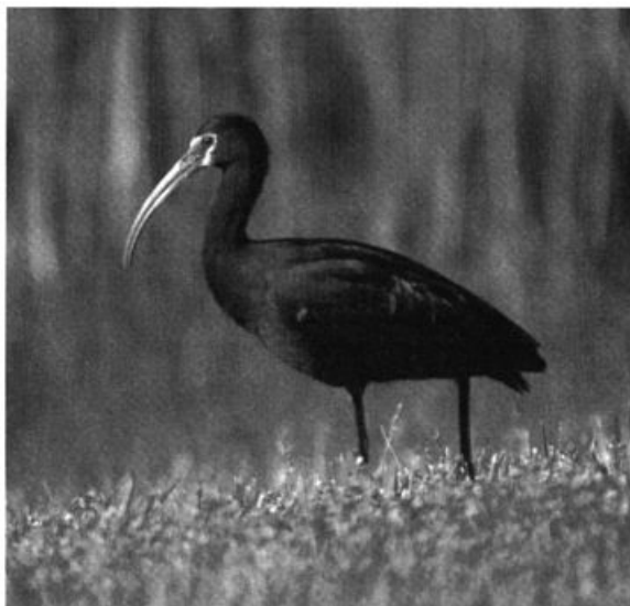
This White-faced Ibis was found 20 May 2006 (here) in the South Point area of Worcester County, Maryland and seen again two days later. Although reported annually in Virginia since 1999, the species is not found annually in Maryland.