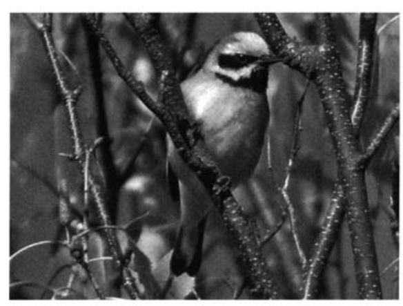
For the third consecutive year, a male Lawrence's Warbler occupied a territory in May 2006 and later (here 15 June) at Lac-Brome, Knowlton, Québec.