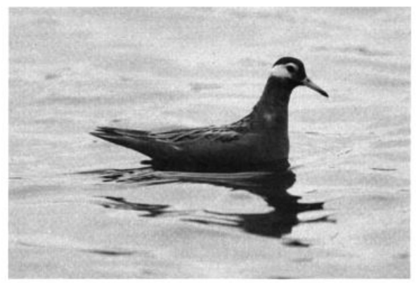
This female Red Phalarope at Napierville, near Montréal, on 14 May was one of about 10 grounded by stormy weather in southern Québec in mid-May 2006.

Up to 2 Blue-winged Warblers were present on their breeding grounds at Lac-Brome in May (PB et al.), while another was at Frelighsburg 21 May (MR, P. Lane). A Lawrence's