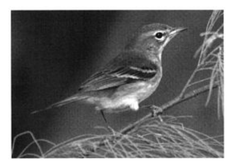
One of the highlights of the 19 December 2005 Ensenada Christmas Bird Count was this first-year female Pine Warbler on the Maneadero Plain, the first to be photographed well in the Baja California Peninsula region.

2004, one of only 2 found in the Region. Additional rare sea ducks were 5 Black Scoters in the far nw. and Long-tailed Ducks at La Fonda 3 Dec (MJB, †MJI) and Estero Punta Banda 19 Dec–31 Jan (†MSM, LAC, AG-A). A Hooded Merganser was at E.S.J.C. 22 Jan (ph. SGM), and 7 were seen in the far north.