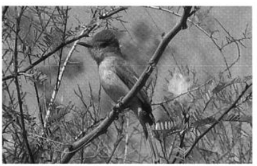
Prior to this year, a Dusky-capped Flycatcher collected in the Sierra de La Laguna 24 June 1896 provided the Region's only record. The second of two this winter was found on 8 March 2006 on the Río Colorado near Ejido Chiapas No. 3.

Yellow-headed Blackbirds are seldom found in the Cape District, but up to 150 were at E.S.J.C. 17–21 Mar (ph. MJI). A female Bronzed Cowbird at Lagunas de Chametla 19 Mar (ph. MJI) was in an area where one or more females were seen on 25 Jan and 7 Oct 2005. The season's only Orchard Oriole was an ad. male at Playas de Tijuana 18 Dec–8 Jan (†DSC, ph. MJB et al.). Northerly female Hooded Orioles were at Ensenada 19 Dec (†RAH, EDZ-H) and Tijuana 3 Mar (MJI, MJB). A Streak-backed Oriole (possibly an ad. female) at Miraflores 22 Jan (ph., †SGM)