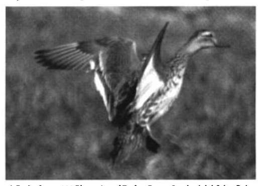
A flock of over 100 Blue-winged Teal at Estero San José del Cabo, Baja California Sur, included this female Garganey 17 March 2006. It was assumed to be a returning individual from one year before.