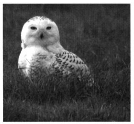
This Snowy Owl, present in Solano County, California 13 (here) and 14 January 2006 thrilled hundreds of observers, particularly those not active when California's last Snowy was seen back in 1978.