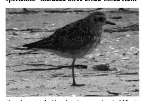
The only species of golden-plover known to winter in California is Pacific Golden-Plover. This one, photographed on 14 January 2006, was present on Mission Bay in San Diego through the winter season.

ith temperatures warmer than average and precipitation less than expected during the winter period, this seemed like the winter that wasn't. This perception was reinforced by the nearabsence of irruptive northern species pushing into the Region, or mountain species moving into the lowlands. The presence of "Arizona specialties" included three Broad-billed Hum-