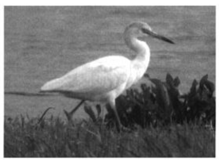
Although usually considered a rare summer visitor to southern and central California, this immature Little Blue Heron lingered from 3 (here) through 16 February 2006 near Fort Dick, Del Norte County, in the extreme northwestern corner of the state. The two previous county records have also been of wintering immatures in the same area.

High densities of Marbled Murrelets were observed along the San Mateo coastline, with 310 and 275 counted off Venice S.B. 21 & 24 Feb (RSTh), respectively, and a county high of 503 off Moss Beach 1 Mar (RSTh). Coupled with these high counts were record-high numbers observed via aerial surveys along the inshore waters of coastal Santa Cruz: 246 on 24 Jan and 232 on 8 Mar (fide LHe). Suddjian comments that these high numbers suggest that many of these birds were likely wintering migrants from the n. and not members of the Santa Cruz Mts. breeding population. Marbled Murrelets made a good showing in Humboldt as well, with 31 on the Arcata C.B.C. 17 Dec (fide DFx). Four Horned Puffins were reported: one at the n. jetty of Humboldt Bay, Humboldt 21 Jan (fide SWH); one picked up at