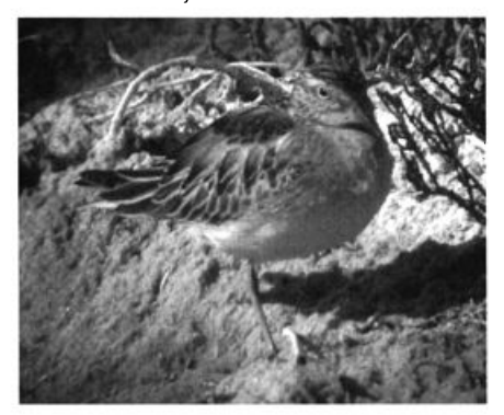
Pleasing crowds of birders in Alviso, Santa Clara County, this juvenile Sharp-tailed Sandpiper spent 7-18 (here 10) December 2005 roosting and foraging with peeps. This species has now been recorded a remarkable three times on the San Jose Christmas Bird Count, the only California count ever to have recorded it.