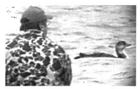
This Yellow-billed Loon on Kentucky Lake, Henry County, Tennessee 4 December 2005 provided the Tennessee & Kentucky region's sixth record; all records come from recent years.