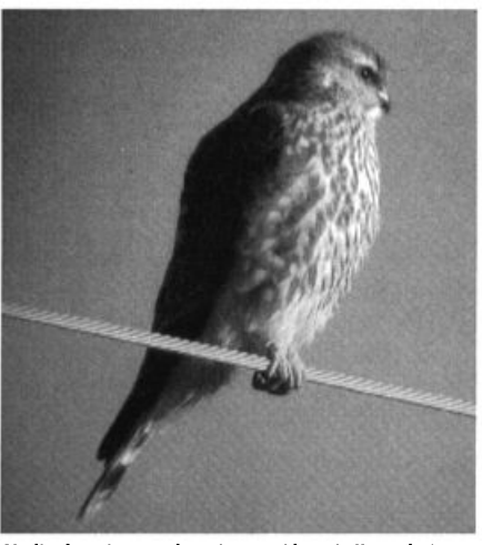
Merlins have increased as winter residents in Kentucky in recent years; this female of the prairie race ( richardsoni) was one of six birds present in a relatively small area in southeastern Muhlenberg County 5 February 2006. This photograph provides the first documentation of the prairie race in Kentucky.