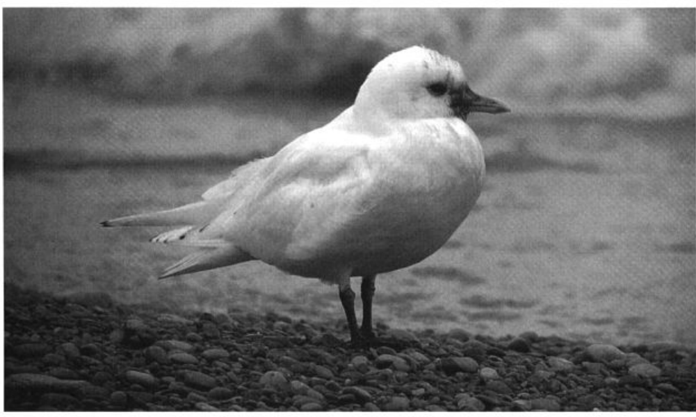
This first-winter Ivory Gull spent 8-13 (here 13) January 2006 at Hillman Marsh, Ontario, a first record for Point Pelee.

sumed to be the bird first seen 18 Dec on the Presqu'ile C.B.C.) was seen 11-31 Jan (RDM, m.ob.). Rusty Blackbirds were reported in better-than-average numbers, at least for recent seasons. At the Tip of Point Pelee, 60 were seen 16 Dec (AW); 120 were at Sturgeon Creek 27 Dec (AW); and 27 were at Port Hope 11 Dec (ERM). Two Brewer's Blackbirds were found at Shrewsbury 9 Dec (JTB), 2 at Erie Beach 18 Dec (KTB, SC), 2 w. of Wheatley