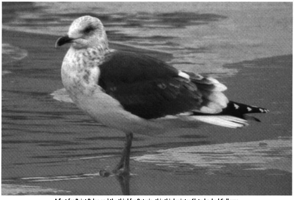
A first for Point Pelee and the third for Ontario, this third-winter Slaty-backed Gull was photographed at Wheatley Harbour 22 January 2006.

with both birds feeding on the bumper Mountain Ash berry crop 27 Dec and 13 Feb (BMo), another was seen at Reevecraig late Dec+(RN, SuL, m.ob.). Single Hermit Thrushes were widely reported from Gravenhurst to