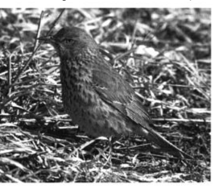
The second recorded in Ontario's Niagara Frontier, this Sage Thrasher hung on despite very cold weather at Port Weller 24-27 (here 26) February 2006.

Lingering diving ducks occasionally winter in numbers off Manitoulin I., but this year the last White-winged Scoter was seen 3 Dec, and a maximum of just 12 Long-tailed Ducks was found over the winter period (fide CBe). A good count of 350 Red-breasted Mergansers came from Cobourg 11 Feb (LWe). The 8 Jan Lake Ontario Mid-Winter Waterfowl Inventory produced near-record numbers of many species, thanks in part to congregations at Hamilton and Kingston. Of these, 843 Tundra Swans at Kingston and 925 Ruddy Ducks at Windermere Basin in Hamilton stood out. Three Barrow's Goldeneyes lingered through the period at the Remic Rapids in Ottawa (m.ob.), along with a Barrow's Goldeneye ×