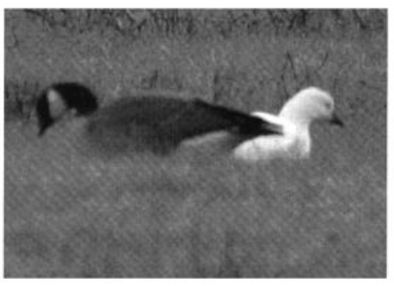
This apparent Cackling Goose in Okaloosa County, Florida 10 December 2005 (here) through 14 January 2006, pictured here with one of nine Ross's Geese also present, will provide Florida's second record.