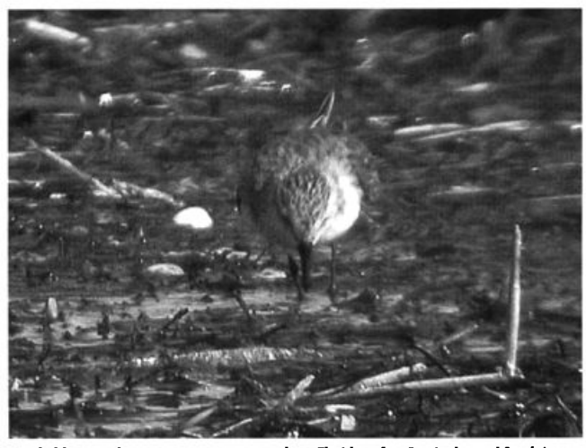
Probably annual in winter in extreme southern Florida, a few Semipalmated Sandpipers were carefully documented by the photographer this season (here 28 February 2006) in Florida Bay.