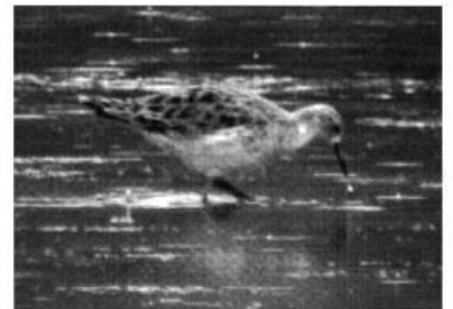
This Ruff, probably an early migrant, was photographed in Colleton, South Carolina on 25 February 2006, providing documentation of a rare winter-season occurrence for the Southern Atlantic region.