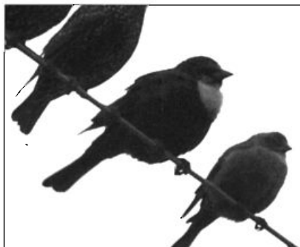
Very rare for the mountains, especially in winter, was this Yellow-headed Blackbird found on the Balsam Christmas Bird Count in Haywood, North Carolina on 29 December 2005.