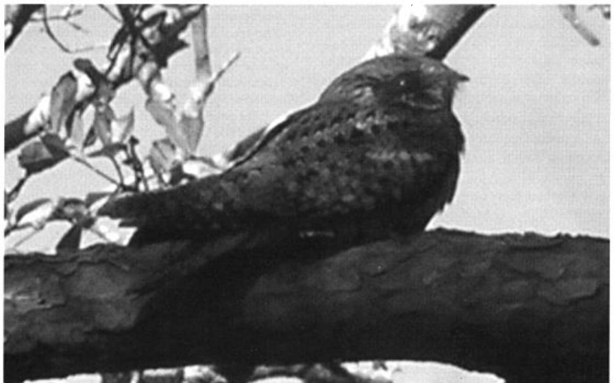
There are few documented winter reports of Chuck-will's-widow in North Carolina. This individual was located in Buxton Woods, Dare County, North Carolina 27 December 2005; a photograph from the same location appears in North American Birds 55: 247.

American White Pelicans continue their increasing presence in the Region. The best counts included 109 on the ACE Basin, SC C.B.C. 1 Jan ( vide PLa), 80 near St. Mary's, Camden, GA 3 Feb (PS et al.), and up to 30 at Drum Inlet, Carteret, NC 22 Jan ( vide JF). The farthest inland were the 15 at West Point L., GA 3 Dec (EB, MB) and 9 at Eufaula N.W.R., GA 8 Jan (JFL et al.). Only one inland Brown Pelican was found, that being at Eufaula N.W.R., GA 3 Dec (JFL, EH). Farther inland than usual in winter was the Anhinga at Holt's L., Johnston, NC 10 Dec (CS). The most unusual reports of long-legged waders were a Great Egret far inland on the Peachtree City, GA C.B.C. 17 Dec ( vide TM), 2 Cattle Egrets at Phinizy Swamp, Augusta, GA in Jan (LS), and a Green Heron far inland at L. Acworth, Cobb, GA 10 Jan (SPg). Georgia had single