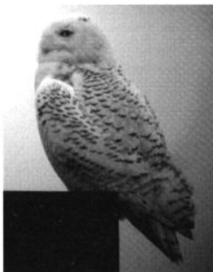
This cooperative Snowy Owl thrilled scores of birders, as it was easily observed from a parking garage at Dulles International Airport, Loudoun County, Virginia between 20 (here 28) January and 17 March 2006.