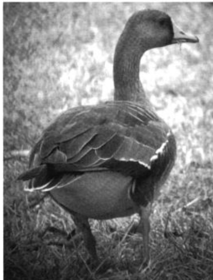
Apparently rare in the Middle Atlantic region, Greater White-fronted Geese of the frontalis subspecies are seldom reported in Virginia and Maryland; this bird, thought to be frontalis, was present 27–30 (here 29) January 2006 in Montgomery County, Virginia.