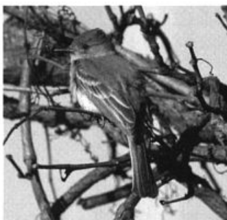
Ash-throated Flycatchers are typically discovered in Virginia in November; this bird was found along the James River in the City of Richmond on 7 (here 8) January and stayed through at least 4 March, likely aided by the mild winter.