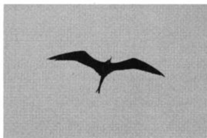
This frigatebird was photographed at the Great Dismal Campground, City of Chesapeake, Virginia 9 November 2005. It might have escaped mention in this column, but it was dutifully reported via eBird < www.ebird.org >, complete with photograph! On the same day, a female Magnificent Frigatebird was observed near Kiptopeke State Park, to the north; these birds were probably evacuees from Hurricane Wilma, which had passed offshore a week earlier.