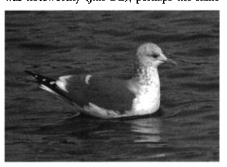
This Mew Gull, a first for Rhode Island, frequented East Providence 6 January through (here) 11 February 2006. Several characters suggest that it represents the eastern Asian subspecies kamtschatschensis, including a relatively dark mantle, large size in relation to Ring-billed Gulls, and bright yellow bill and legs.

Despite the plethora of other half-hardies, Tree Swallows did not appear in unusual numbers or places, although a "probable" individual of this species in S. Portland 6 Feb was noteworthy (fide DL), perhaps the same