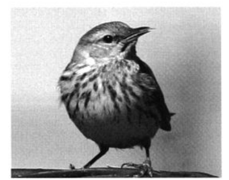
Very rare in midwinter in New England, this Cape May Warbler was photographed on 16 February 2006 in Rutland, Vermont.

Commons and 4 Thick-billeds were seen 3 Jan (RH). Razorbill numbers seemed about average at seawatch sites at Rockport and Cape Cod. One clear exception was a tally of 8400 from N. Truro, MA 28 Jan (BN).