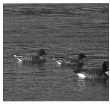
Two Pink-footed Geese associated with a large flock of Canada Geese on the Connecticut River in Enfield, Connecticut 4-12 (here 7) February 2006. If accepted, these would represent the first winter record of the species for New England.

feeders, and an Audubon's Warbler in Rye, NH. Two other Audubon's were in Charlestown and Wersterly, both Washington, RI 28 Jan and 11 Feb, respectively. A quick run-down of other noteworthy warblers includes a Nashville on Cape Cod through 20 Feb, Black-throated Blues in Connecticut and Massachusetts, a Black-throated Green in