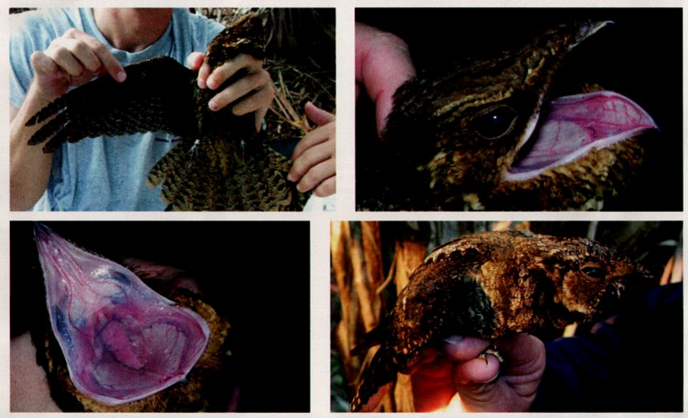
Most birders observe nightjars only as moth-like apparitions rising off roadsides, but banders see them in the light of day. This female Chuck-will's-widow (upper left) was banded 12 September 2005; another female, banded 29 September 2004 (two views), shows the enormous gape, large enough to swallow a warbler whole, as this species sometimes does. Seventeen "Chucks" have been caught at Cape Florida, but just one Whip-poor-will, this bird 26 October 2005, a male (lower right).