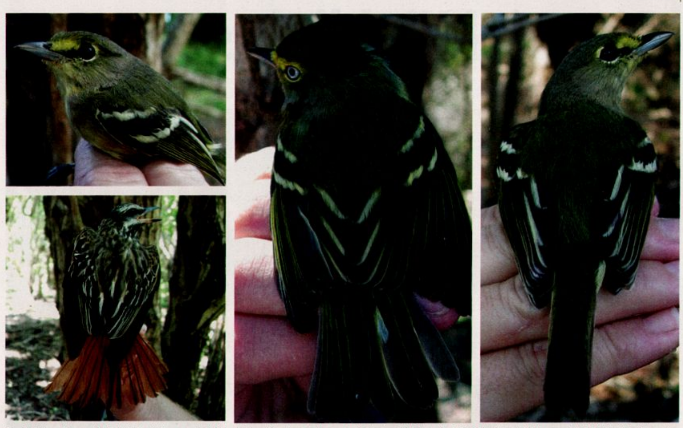
Cape Florida's position, as well as its habitat, make it a magnet both for local birds and for migrants and vagrants, whether from the Bahamas (just 100-200 km distant) or farther away. This Thick-billed Vireo (7 November 2005; right; upper left) represented just the fourth verified record for Florida (a White-eyed Vireo makes a nice comparison, 26 October 2005; center), whereas this Sulphur-bellied Flycatcher (8 October 2005; lower left) was just the fifth for Florida.