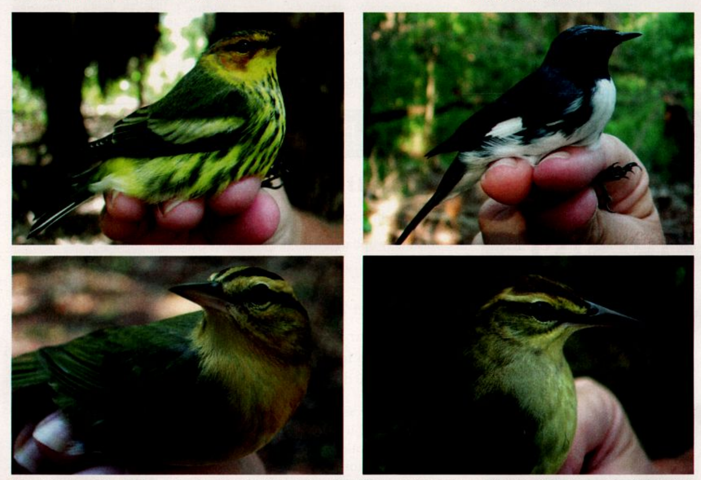
Warblers that winter largely in the West Indies are seen in southern Florida during both fall and spring migrations. But capture rates, for instance, of Cape May Warbler (male, 12 October 2004; upper left) and Black-throated Blue Warbler (male of the Appalachian subspecies caimsi ; 16 September 2005; upper right)—both Neotropical migrants that winter mostly in the Caribbean—are surprisingly different at Cape Florida. The former is relatively rare (9 captures), the latter the most common warbler captured (707), even outnumbering the abundant Ovenbird (672). Species that winter both on Caribbean islands and the Caribbean slope of Mexico and Central America, such as Wormeating Warbler (28 September 2004; lower left) and Swainson's Warbler (14 September 2004), have also turned out to be more common than Cape May Warbler, with 205 and 42 captures, respectively.