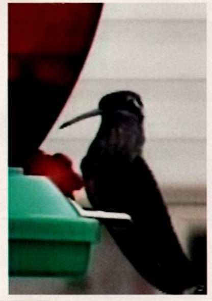
A first for South Dakota and the Region, this female Magnificent Hummingbird was a surprise in a Sturgis yard 18 June 2005.