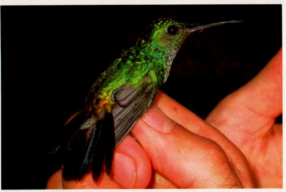
Although reported in the same area in April 2003, this Blue-chested Hummingbird mistnetted at Las Marías in the Departmento Gracias a Dios provided the first photographic evidence of its occurrence in Honduras.