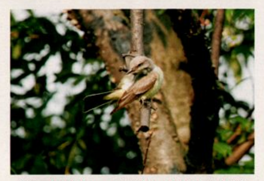
Western Kingbird is an expected fall vagrant in the East and Midwest, but summer records are far more unusual. This bird 29 July 2005 at Jacksonville, Indiana County, Pennsylvania was enjoyed by many during its short stay.