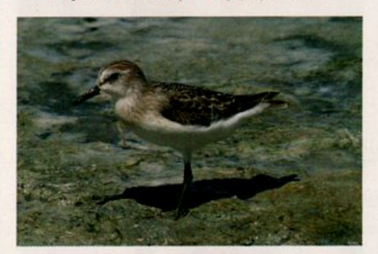
Semipalmated Sandpipers are rare but regular migrants through the Great Basin. Photographed at Carson Lake, Churchill, Nevada, this bird was a southbound migrant 23 July 2005.