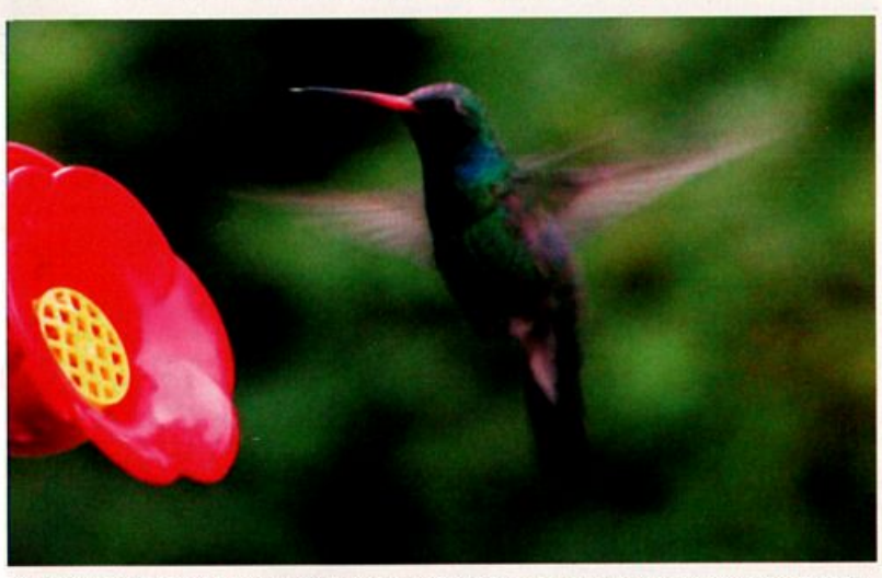
This adult male Broad-billed Hummingbird at Colington, Dare County 15 (here) and 16 July 2005 was North Carolina's second, the first being near New Bern in October 2001.