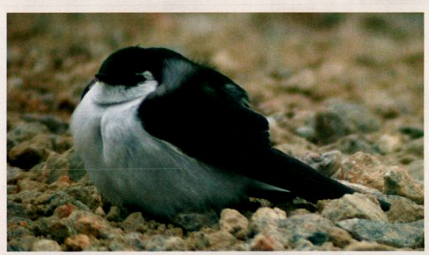
A vagrant in the Bering Sea, this Violet-green Swallow was seen at Gambell, St. Lawrence Island, Alaska 1 June 2005.