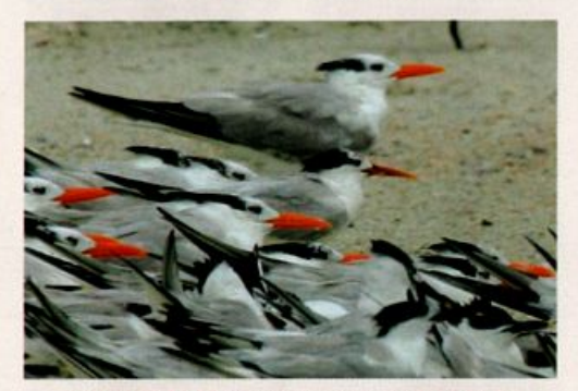
This presumed Sandwich Tern x Elegant Tern hybrid was at Sand Island, Mississippi 30 June 2005. These two species have been recently documented in mixed pairs on the Gulf Coast of Florida.