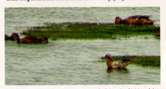
This drake Garganey, here 19 June 2005 at the Brigantine Division of the Edwin B. Forsythe National Wildlife Refuge, was seen at two coastal New Jersey locations on three occasions in June.