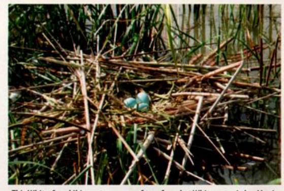
This White-faced lbis nest was one of two found at Whitewater Lake, Manitoba on 7 July 2005, a first confirmation of breeding in this species for the province.