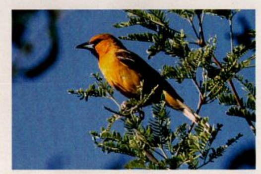
After an increase in records and multiple nestings in the mid-1990s, Streak-backed Orioles have become scarcer in Arizona in recent years. This bird was observed in Tumacacori 23 (here 25) July through 1 August 2005.