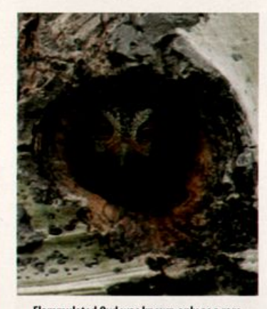
Flammulated Owl was known only as a rare migrant in Wyoming until 2002, when three were found summering in the Battle Creek drainage of the Sierra Madre Mountains. An organized group searched this area 8-10 July 2005 and found ten Flammulated Owls, including this nesting bird 9 July.