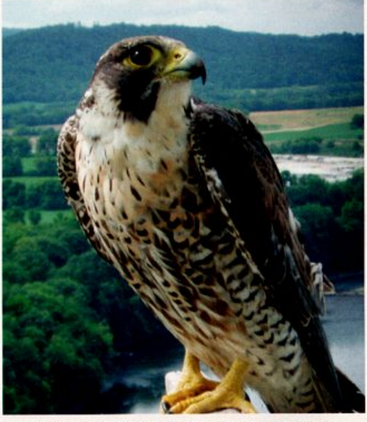
In Northampton County, Pennsylvania, Peregrine Falcons bred successfully for the first time since the late 1950s in a nest box high on one of Pennsylvania Power and Light's Martins Creek power plant smokestacks. This female (here 27 June 2005) fledged two young on 11 July.