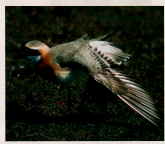
This adult male Lesser Sand-Plover (of the nominate race) adorned Gearhart, Clatsop County, Oregon from 16 through 18 (here) July 2005. There are three previous records from Oregon, all of adults, the most recent in 1986.