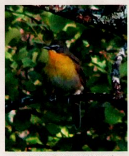
Manitoba's first Yellow-breasted Chat in nearly a decade, and about the twentieth overall, was this bird near Grande Clairière 20-26 June 2005 (here on the latter date).