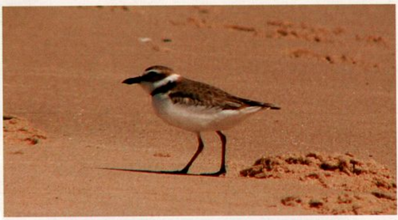
This adult Wilson's Plover was seen 8 June 2005 at Grosse Ile, Magdalen Islands, Québec, providing a first record for the province. Other wanderers have turned up recently in New Hampshire, Rhode Island, New York, and Massachusetts.