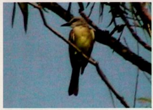
This Tropical Kingbird was at Grand Isle, Louisiana 23 July 2005, a most unusual summer record for the Gulf Coast.