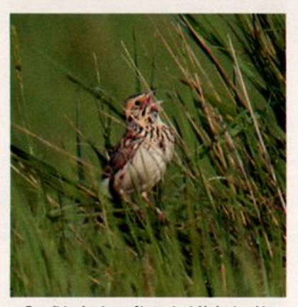
Tantalizing by virtue of its territorial behavior, this singing male Baird's Sparrow near Cheyenne, Wyoming was noted on 16 (here) and 17 June 2005 but not later. The species is not known to nest in the state.