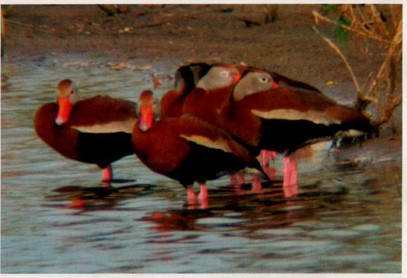
These Black-bellied Whistling Ducks were found in Gibson County, Indiana on 14 July 2005, possibly pushed there by the remnants of Hurricane Dennis, which arrived in the area 12 July. This sighting constitutes Indiana's second record.