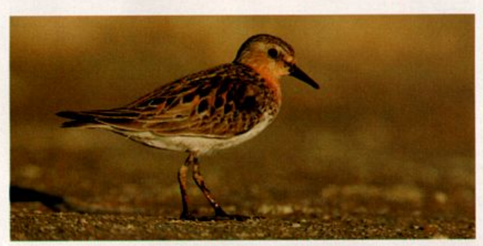
Totally unexpected was the appearance of this adult Red-necked Stint at China Lake, Kern County, California on 13 June 2005; it was the only shorebird present at this location.