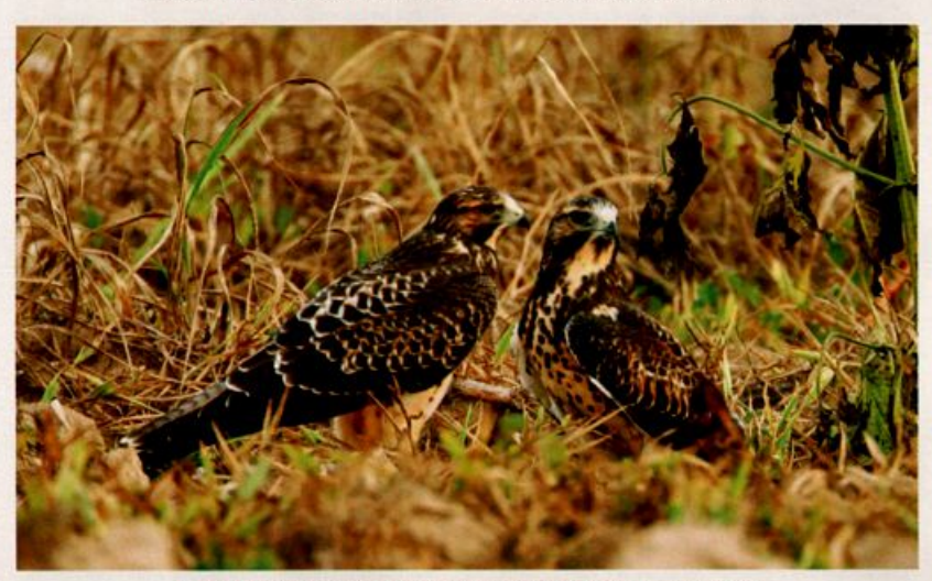
These juvenile Swainson's Hawks were probably evidence of local breeding in Vermilion, Louisiana 26 July 2005.