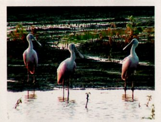
Roseate Spoonbill is an extreme rarity in Tennessee, and five near Reelfoot Lake in Obion County (three here, 26 July 2005) was without precedent.