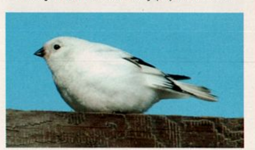
Furnishing first for the Yukon Territory and one of just a few records for Canada, this male McKay's Bunting was a star attraction at Herschel Island from 16 (here 22) July through at least 28 July 2005.