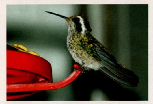
Several White-eared Hummingbirds ventured into record-high northern latitudes in the summer and fall of 2005. This bird, Colorado's first, delighted birders in Durango from 19 June through 7 August 2005 (here 20 July).