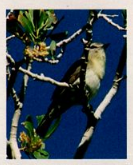
In a summer that produced a variety of records of species rarely recorded in California in summer, this Philadelphia Vireo—present 30 June (here) through at least 13 July 2005 in Mono County—may have been the most noteworthy, as it was the first ever found in the state during summer.