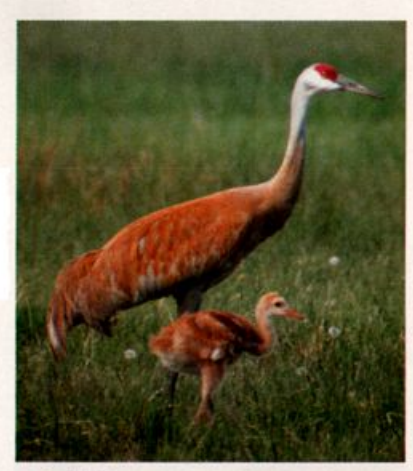
A Sandhill Crane pair (with colt) was noted at Lower Latham Reservoir, Weld County, Colorado in early May, representing the first successful breeding by this species in modern history on Colorado's Eastern Plains (here 28 May 2005).