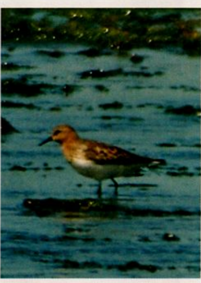
Washington's first fully documented Red-necked Stint was at Dungeness Bay, Clallam, from 28 (here 31) July 2005 into August. Oregon and Washington together have about eight prior records, all of adults on the westside.