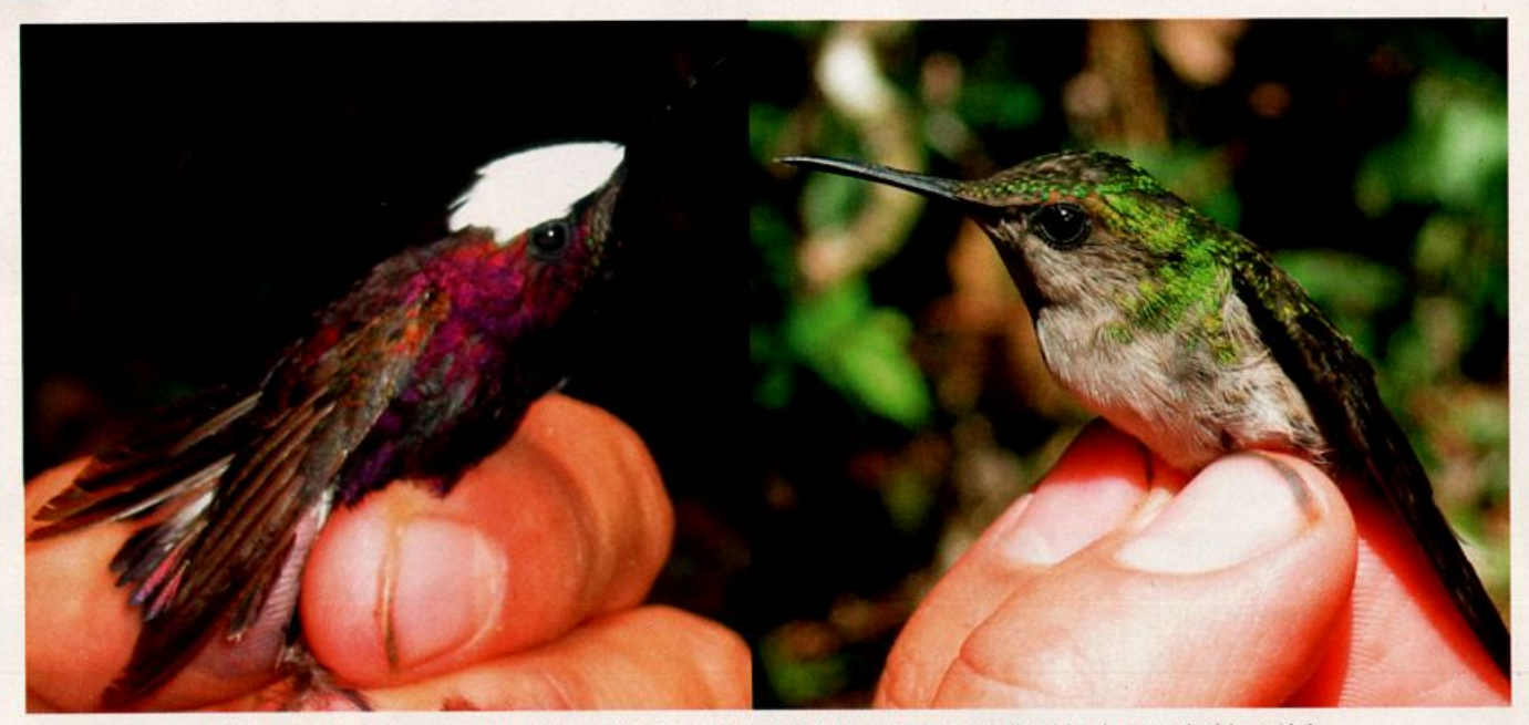
This presumed pair of Snowcaps, mist-netted near Las Marías, Departmento Gracias a Dios on 31 July (female) and 1 August (male), provided the first documentation of its occurrence in Honduras. Previous reports in this area have been anecdotal.