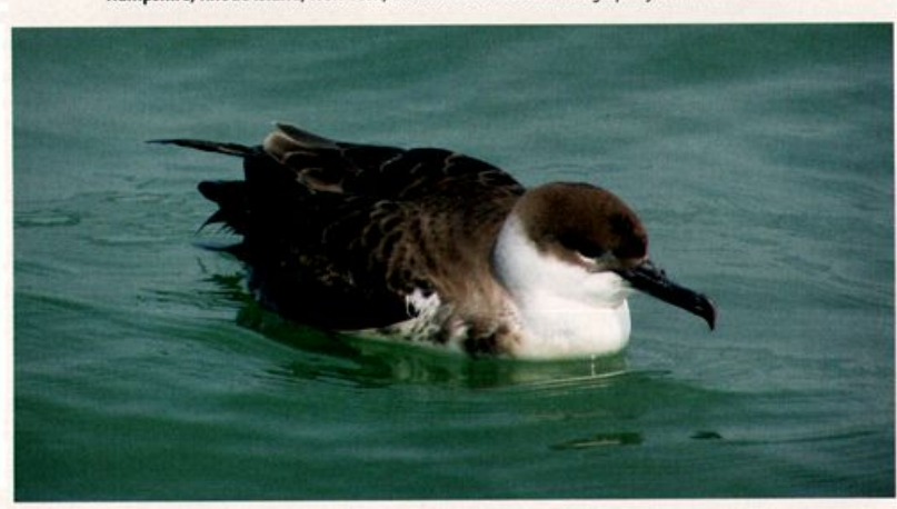
All up and down the Atlantic Coast, but especially in the Southeast, Greater Shearwaters were found inshore in summer 2005, as well as dead or moribund on beaches. This apparently starving bird approached a small fishing boat at the mouth of Chesapeake Bay 7 July 2005.