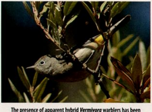
The presence of apparent hybrid Vermivora warblers has been known for several years from the central Davis Mountains, Texas. These Virginia's × Colima Warblers are large in structure and have an intermediate song. This summer at least 9 territorial males were found, including this bird 11 June 2005.