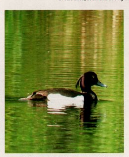
A visiting birder from Germany found this Tufted Duck, the Yukon's second, near Rancheria Falls 4 (here 15) June 2005; it remained through 23 June.