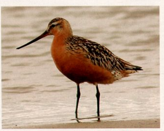
This Bar-tailed Godwit was present 12-31 (here 13) July 2005 at Stephenville Crossing, Newfoundland, a third provincial record of this species. It was identified as subspecies baueri based on the heavily barred underwing coverts and barred lower back.