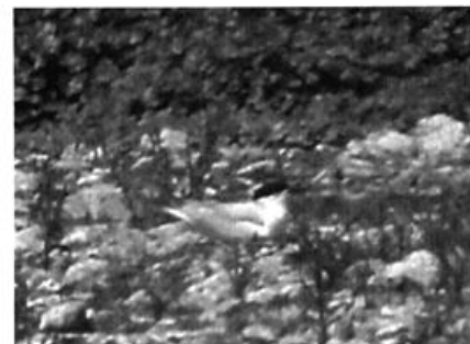
This Gull-billed Tern was photographed at its nest in Parque Ecológico Xochimilco in Mexico City, where two pairs were found nesting in late May and early June 2005 (here 2 June); there are no records for the subregion otherwise.

A flock of 40+ Lilac-crowned Parrots were at Bahías de Huatulco 24 Jun (MDC et al.). Six Black Swifts were at Huayapan 25 Jun (MG), and 7 Great Swallow-tailed Swifts were at 775 m elevation above La Sepultura Reserve n. of Arriaga 21 Jun (RR, MDC et al.). A Violet-crowned Hummingbird (but bill all dark above) was seen at P.A.D. 7 Jun (JF). A female Garnet-throated Hummingbird was seen at Llano Grande 17 Jun (MG). A few Wine-throated Hummingbirds were feeding on flowering thistles in the wetland 5 km s. of San Cristóbal de las Casas 21 Jun (MDC et al.). A Strong-billed Woodcreeper was at Cerro Huitepec, near San Cristóbal de las Casas, as was a Scaled Antpitta 20 Jun (RR, MDC et al.). Many Greenish Elaenias at