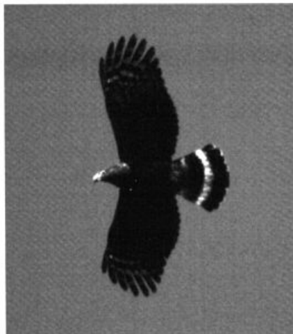
A pair of Hook-billed Kites in the UNAM botanical garden in Mexico City found 4 June 2005 (here) furnished the first summer record of this species in the subregion, which until recently had not been recorded at any season (with the exception of old records).

late May/early June, with many more hummingbirds in evidence toward the end of the season. Records are from Oaxaca unless otherwise stated.