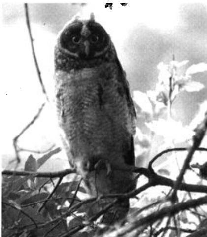
This adult Stygian Owl was one of two found near Casa de Piedra in June, furnishing the first record for the state of Tamaulipas (here 17 June 2005); there are two records from neighboring Texas.

was a transient species on the Yucatan Pen., but for the past 15 years, large flocks spend the winter here, and a few individuals have