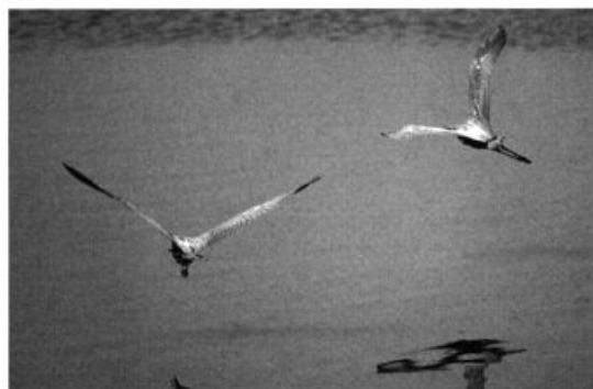
These young Reddish Egrets at Bolsa Chica in late July 2005 were two of three present in coastal Orange County, California, at that time.

A South Polar Skua was seen from San Clemente I. 10 Jun (JMCM). Late spring migrant Franklin's Gulls were at N.E.S.S. 8 Jun (MSanM), in Santa Barbara 14 Jun (JMG), and near Lancaster 20 Jun (MSanM); one at S.E.S.S. 29 Jul (GMcC) was a hatch-year bird recently arrived. Five Heermann's Gulls, rare inland, were found at S.E.S.S. between 26 Jun and 3 Jul (JFG, GMcC, HBK). Gull-billed Terns had a highly successful season at S.E.S.S., with over 180 pairs fledging at least 150 young at a single colony at Rock Hill, over 250 pairs of Caspian Terns also nested at Rock Hill and Mullet I., with many young fledged from the former site (KCM). Two Elegant Terns were inland at S.E.S.S. 25 Jun (JFG), another was there 2 Jul (MTH,