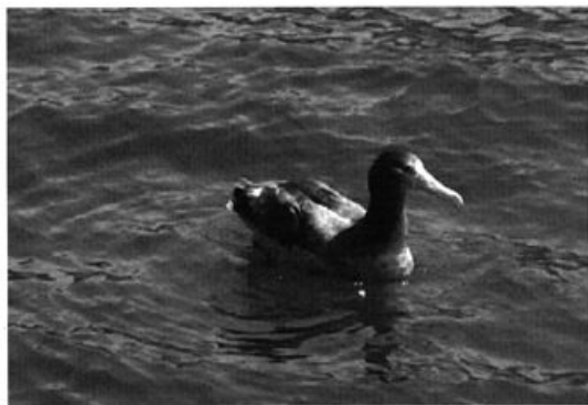
This confiding subadult Short-tailed Albatross was only a short distance off the pier at Prisoner's Harbor on Santa Cruz Island, California 6 July 2005.

Barbara 13 Jul+ (DMC) and another on Upper Newport Bay, Orange 15 Jun (NK) were the only ones found away from San Diego. Reports of Reddish Egrets included one at Point Mugu, Ventura 31 Jul (DP), 3 in coastal Orange 9 Jul+ (BED, LRH, LW), and single birds on s. San Diego Bay, San Diego 22 Jul (JBa) and 29 Jul+ (MC). Two subad. Yellow-crowned Night-Herons remained in Imperial Beach, San Diego 27 Jun+ (LW-L, MJB, MS); this species is a casual straggler to California from w. Mexico. Two ad. Glossy Ibis were found in the Imperial Valley, Imperial, with one near Calipatria 16–17 Jul (PEL, JF) and the other near Westmorland 29 Jul (CC); this brings the total number now recorded in California to eight.