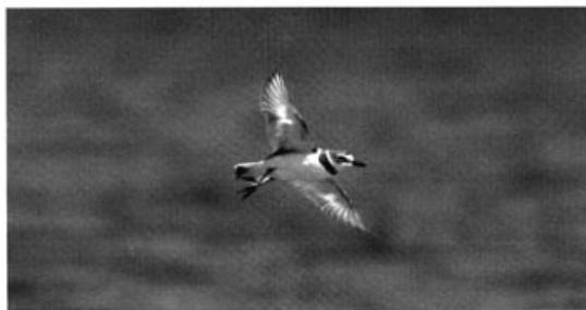
This male Wilson's Plover spent the month of June 2005 (here 4 June) among nesting Least Terns at Batiquitos Lagoon, San Diego County, California.

A juv. Black-throated Sparrow at Playa del Rey 24 Jul (KGL) was a very early vagrant to the coast. One of the few significant Grasshopper Sparrow populations in the greater Los Angeles area is at Rancho Sierra Vista near Newbury Park, Ventura , where 6–9 territorial males and several juvs. were