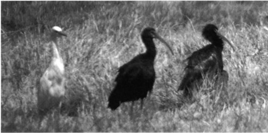
One of two Glossy Ibis seen in the Imperial Valley in July, this one (right) was photographed with a White-faced Ibis and a Cattle Egret near Calipatria, Imperial County, California on 17 July 2005.

GMcC), and one more was at N.E.S.S. 2–3 Jul (CMcG, JFG, HBK). Small numbers of Least Terns are now found on the Salton Sea every summer, with up to 4 at S.E.S.S. 2–29 Jul (MTH, GMcC) and 2 at N.E.S.S. 3 Jul (HBK); however, 2 elsewhere inland at the Prado Basin, San Bernardino 25 Jun (DVP), one near Lancaster 24 Jun (LS), and another on Tinemaha Res. 16 Jun (JLD) were far more noteworthy. Numbers of Common Terns at Coronado increased from one on 20 Jun to 40+ at the end of the period (MS); this species was much more numerous throughout California in the 1970s but has decreased dramatically since that time. About six pairs of Forster's Terns nested this year at S.E.S.S. (KCM). Black Skimmers had their first successful season at the Salton Sea since 2001, with over 500 pairs fledging at least 200+ young (KCM); 2 in the Prado Basin 28 Jun–1 Jul (JEP) provide one of a very few records for this species in San Bernardino . Up to 5 Pigeon Guillemots off Pt. Vicente between 12 Jun and 9 Jul (KGL) and one off South Laguna 19 Jul (KLP) were unusual for this far s.; 4 at San Clemente I. 10 Jul (JMCM) were exceptional. A Tufted Puffin, rare off s. California, was near Santa Cruz I. 5 Jun (KLG).