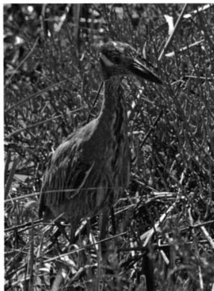
One of two subadult Yellow-crowned Night-Herons present in Imperial Beach, San Diego County, California after 27 June 2005, this bird was photographed on 28 August 2005.