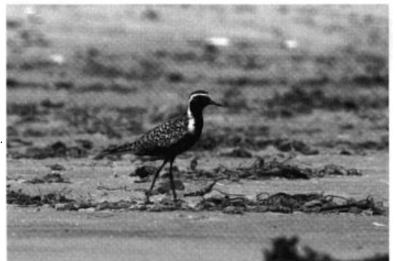
In Coronado, San Diego County, California, this stunning Pacific Golden-Plover was present for one day, 22 June 2005.