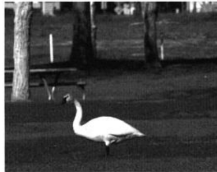
This young Tundra Swan, photographed on 7 March 2005, remained through the summer in California City, Kern County, California.

to be a breeding pair and if so would establish the first record for nesting in the Salton Sink. An ad. male Allen's Hummingbird was well photographed in El Centro, Imperial 29 Jun (KZK) to substantiate the 3rd fall record at the Salton Sink. A Gila Woodpecker at Corn Springs near Desert Center, Riverside 4 Jun (JFG, CMcG) was well away from any known area of normal occurrence.