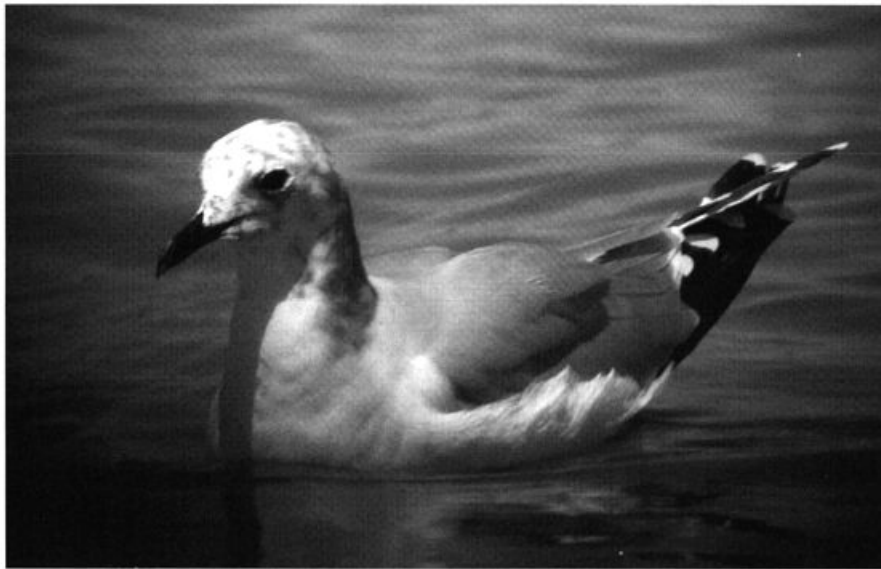
Nearly unprecedented in Arizona in June, this Sabine's Gull was part of an array of surprises at Willcox between late May and early June 2005 (here 7 June).