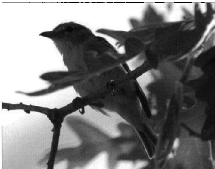
A rarity in Arizona at any season but most surprising in summer, a Yellow-throated Vireo in Carr Canyon 20 July 2005 was found during the American Birding Association convention, held at Tucson.

A Western Tanager in Sabino Canyon 13 Jun (WR) was likely a very late spring migrant. The pair of Flame-colored Tanagers that nested in Madera Canyon during the spring attempted another nesting in Jun but were not reported after 10 Jul (m.ob.). Two White-crowned Sparrows on Humphrey's Peak near Flagstaff 30 Jun (CL) suggested local breeding there. At least 11 Rose-breasted Grosbeaks were reported across s. Arizona 5 Jun-31 Jul (m.ob.); this species has become rather numerous during the late spring and summer in Arizona in recent years. Another low-elevation report from Sabino Canyon was of a Black-headed Grosbeak 13 Jun (WR). A Lazuli Bunting on Mt. Hopkins Rd. 13 Jul (JLD) was a bit early, but at least 50 (mostly ad. males) at Kino Springs 31 Jul-2 Aug (JLD et al.) were more in line with this species' pattern of staging in s. Arizona in late summer before continuing southward into Mexico for the winter. Of note were individual Indigo Buntings at Cow