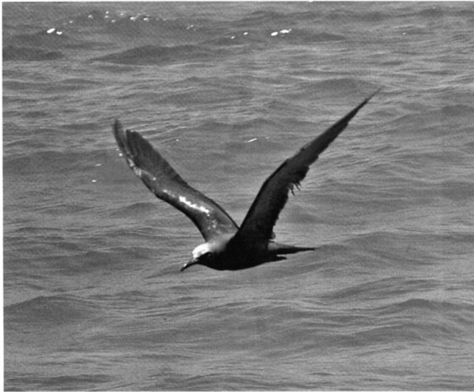
This Brown Noddy was fairly easily observed off the jetty at South Padre Island, Texas 20-26 (here 21) June 2005. All of the other records of this species in Texas have been one-day wonders, hurricane waifs, or seen at sea.