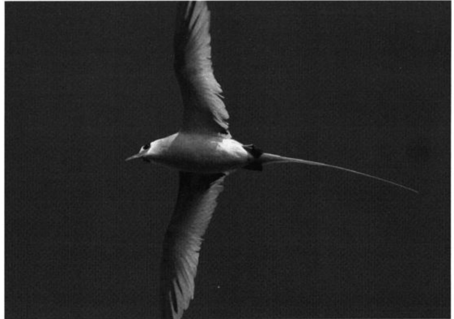
For the second year in a row, a Red-billed Tropicbird delighted birds on the pelagic trip 17 June 2005 (here) off South Padre Island, Texas pelagic trip. The bird was monitored from 14 June-19 July by the boat's captain, making this the longest staying Red-billed of the eight recorded in the state.

other near Midland 26 Jul (BL) marked a first summer record for the area. More exciting was a Sharp-shinned Hawk carrying food 28 Jun near Cedar Creek Res., Kaufman (BG, DH), where the species is not known to nest. A Harris's Hawk seen n. of Fort Stockton, Pecos 29 Jul (DO, COJ) was away from typical locations for the species. As cavity nesters, American Kestrels may be finding more and more suitable nesting sites in ur-