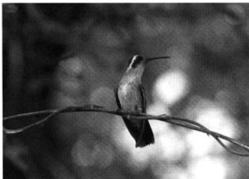
This first-year White-eared Hummingbird at Lubbock 12-18 (here 14) July 2005 was the most unexpected part of an invasion of this species into Texas and the Southwest. A staggering 14 were documented from the Davis and Chisos Mountains in the Trans-Pecos.