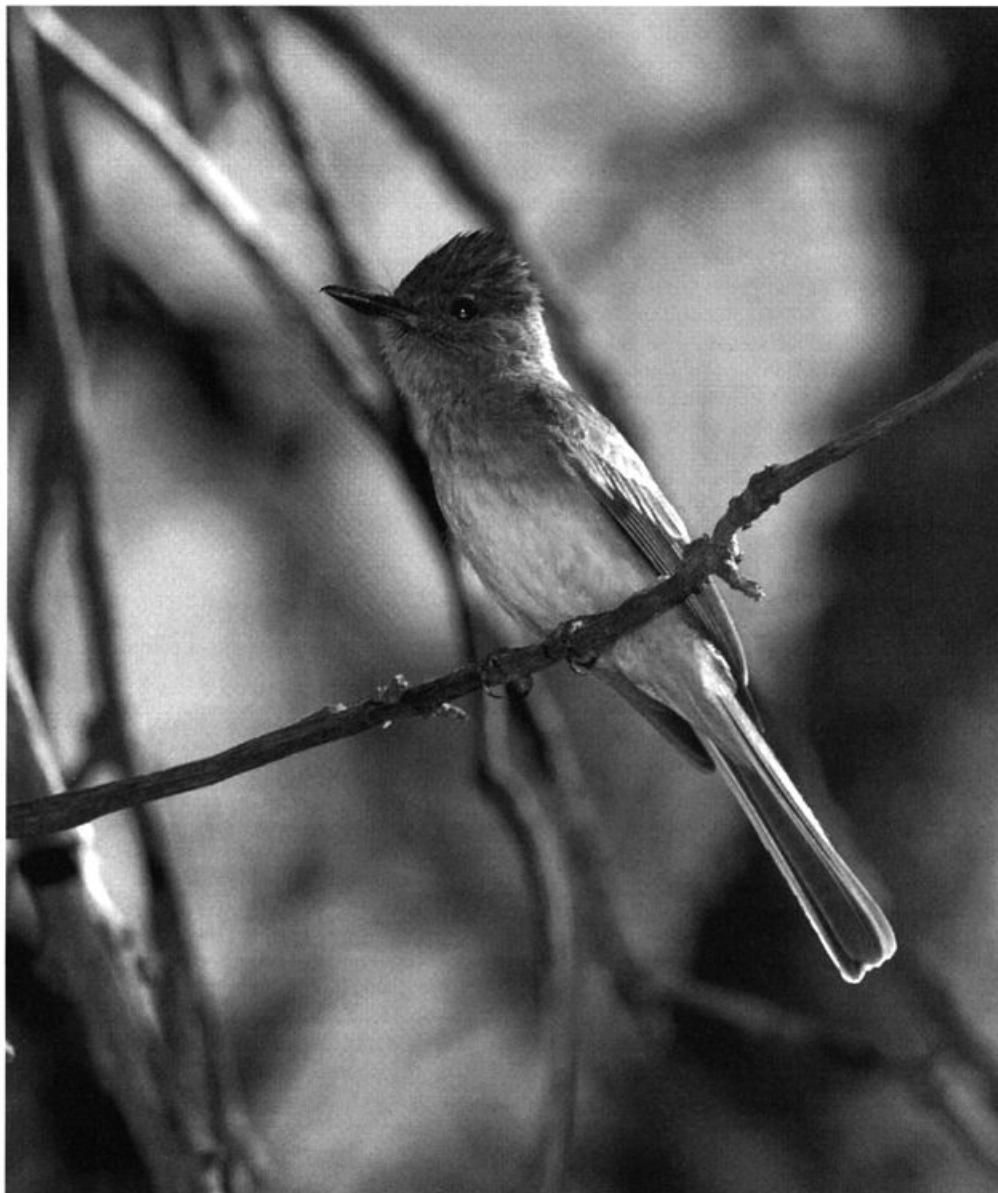
For the second consecutive year, multiple pairs of Dusky-capped Flycatchers were present in a secluded canyon in the Davis Mountains, Texas. Three territories were discovered 14 June 2005 (here), with at least two of them successfully fledging young.

A wandering Black-headed Grosbeak in the Franklin Mts., El Paso 2 Jul (JPa) was at least three weeks ahead of the normal arrival dates for fall migrants. Also unexpected were single Black-headed Grosbeaks at Canyon Country Club, Randall 20 Jul (I&WD) and Palo Duro Canyon S.P., Randall 27 Jul (KS). A male Pyrrhuloxia at Millers Creek Res., Throckmorton 4 Jun (BG) was well ne. of the breeding range of this species. A singing Indigo Bunting was in the Franklin Mts., El Paso 19 Jun (JPa). This species nested in small numbers in these mountains in the 1980s, but they have been absent in recent years, perhaps due to prolonged drought. Indigo Buntings continue to be found in small numbers at White River L., Crosby (BB), but a male at L. Six, Lubbock 12 Jun (BB) was unexpected. A pair of Painted Buntings tending fledglings at Muleshoe