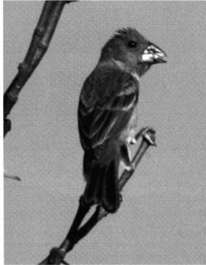
Blue Grosbeak is a scarce breeder in the southern corners of Pennsylvania. This female was discovered feeding young in Peace Valley Park, Bucks County on 29 June 2005.

ad. and a possible juv. Black Tern were seen sporadically at P.I.S.P. 18 Jun–4 Jul (MV, B. Gula). In the vicinity of the Western Basin marshes in Ohio, up to four breeding pairs barely hang on. A late spring migrant was detected 12 Jun at Englewood Reserve, Montgomery , OH (R. Asamoto). Two Caspian