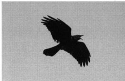
Fish Crows returned to the colony discovered last year at Forest Hills, Allegheny County, Pennsylvania (here 26 June 2005).