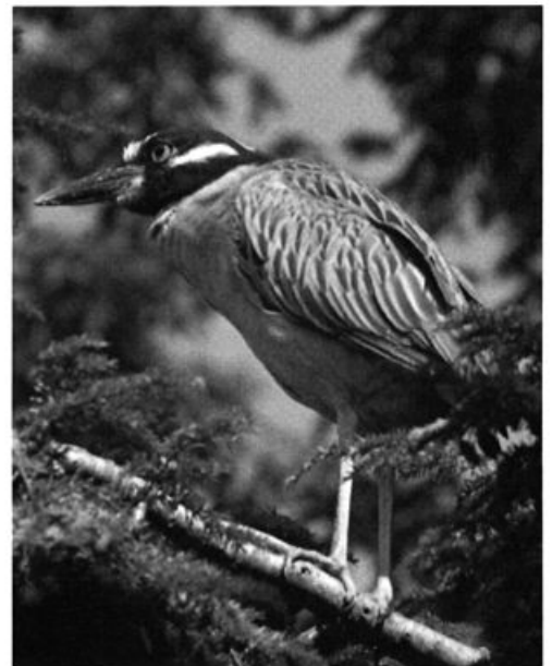
This Yellow-crowned Night-Heron at Kiwanis Park, York County, Pennsylvania could be one of the last nesters in the state; Kiwanis Park is Pennsylvania's last known location for this always uncommon but formerly regular bird.