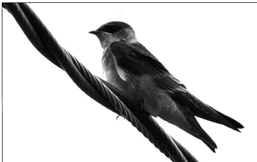
Arkansas finally got its first record of Cave Swallow when this juvenile was found and photographed 29 May 2005 at Millwood Lake. The bird was last seen there on 2 June.