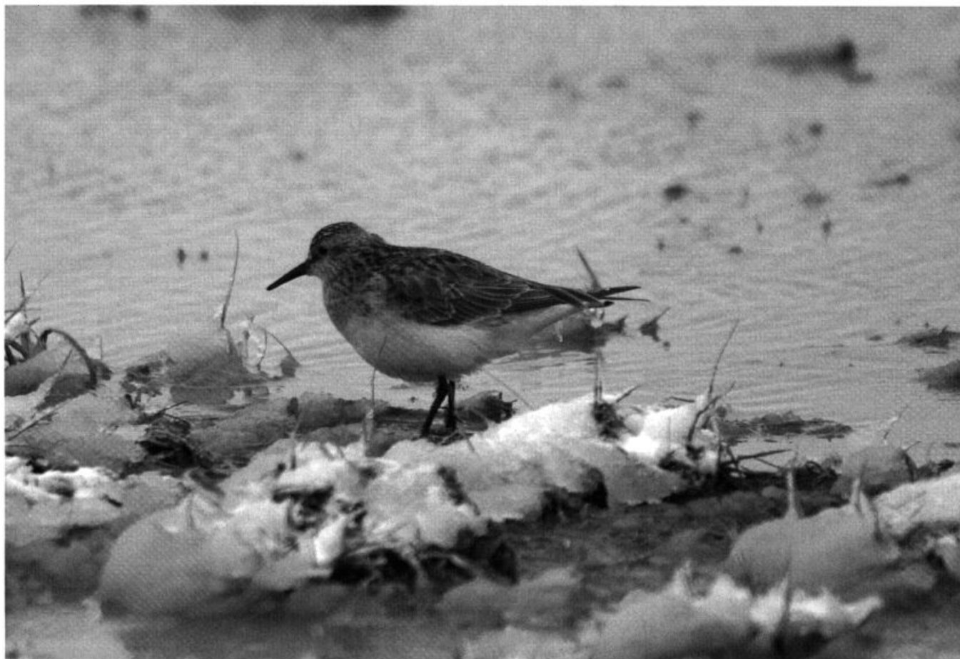
Not only remarkably early but very rare in spring anywhere on the East Coast, this Baird's Sandpiper was photographed 8 April 2005 at Creagerstown, Maryland.