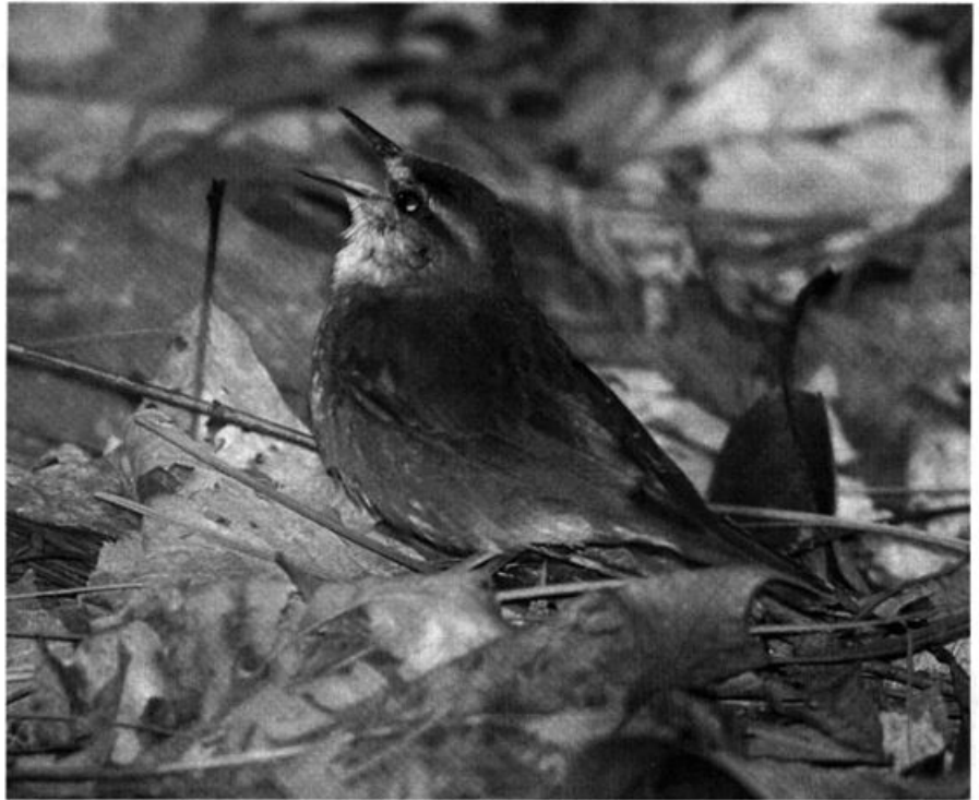
A most unusual find at the American Chestnut Land Trust, Calvert County, Maryland was this Swainson's Warbler 23 May 2005. The species is nearly gone from the state as a breeder in the Pocomoke Swamp and has never been documented nesting in Calvert County.