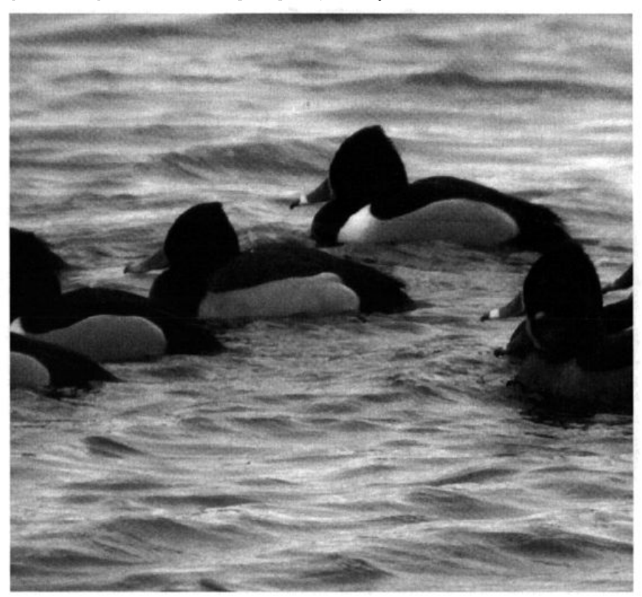
This drake Aythya (at rear) in Damariscotta Mills, Maine 7 March 2005 was probably a Ring-necked Duck × scaup hybrid.