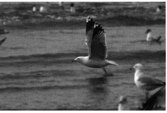
Quite rare in New England, California Gull was recorded twice in spring 2005. This adult in alternate plumage was at Lynn, Massachusetts 29 April – 5 May 2005 (here 30 April); it provided a fourth state record.

A maximum of 31 Black Vultures in Sheffield, MA 28 Apr (B.O.) represented a new state high count, but in light of the current trend, such counts may soon be as rou-