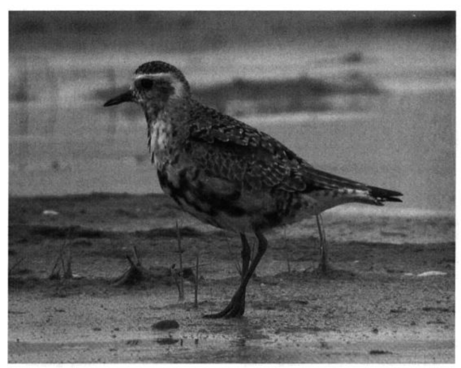
Before it molted into alternate plumage, this American Golden-Plover in Chatham, Massachusetts (here 5 May 2005) provided a clinic in the finer points of differentiating this species from Pacific Golden-Plover.