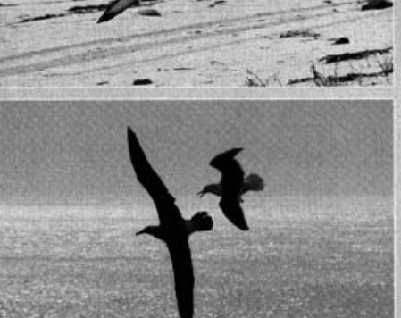
This adult Atlantic Yellow-nosed Albatross was photographed nicely as it flew around Tuckernuck, Massachusetts 29 May 2005. It provides the first photographic evidence of any albatross species for the state.

setts came from Penikese I. ( Dukes ) and Nantucket. In light of albatrosses'long life spans and (especially) their strong nest site fidelity, and given the fact that they rarely fly over land except at or near their colonies, it is not unreasonable to think that the Tuckernuck bird may have been the same individual that approached Matinicus six years ago and made several passes over Penikese and Nantucket five years ago—and that each time it was possibly prospecting for nest sites. In fact, such repeat performances among albatrosses wandering in the North Atlantic are not unprecedented. The most famous example was that of a Black-browed Albatross that returned to the same gannetry in Scotland for over 20 years!