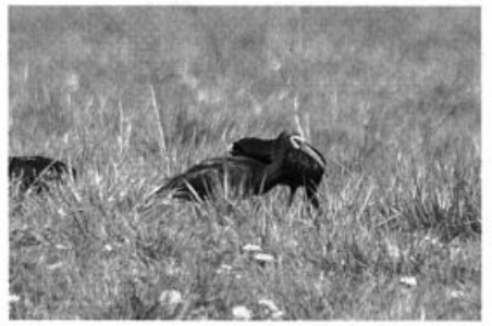
Rhode Island and Massachusetts both enjoyed White-faced Ibis in spring 2005. In the upper pair of images are single birds at Plum Island 25 April and Newbury 22 May; at lower left is another view of the Plum Island bird 26 April, and at lower right, a different adult at Jamestown, Rhode Island 2 May.

species. A rather early Wilson's Plover at Seabrook, Rockingham, NH 1–8 May (B. Clifford et al., ph.) furnished the 2nd record for the Granite State. One or 2 Curlew Sandpipers were noted in Newburyport, MA