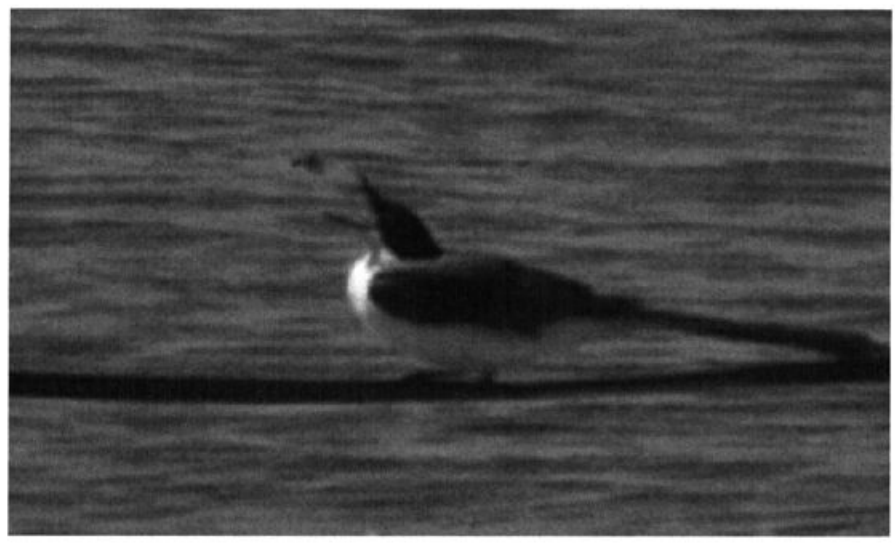
Rare in any season, but especially so in spring, this Fork-tailed Flycatcher at Nantucket, Massachusetts 18-20 (here 20) May was photographed while "processing" an insect.