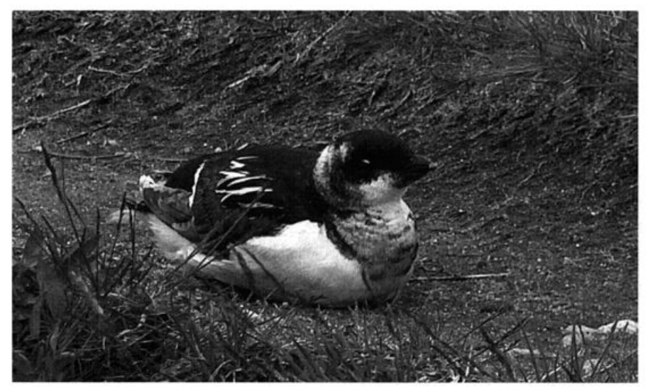
This wrecked Dovekie was a surprise find at Nantucket Island, Massachusetts 26 May 2005. Not only was it very late, but it was the only one of its kind among various other species of seabirds that appeared in coastal New England during a series of back-to-back ocean storms in late May.