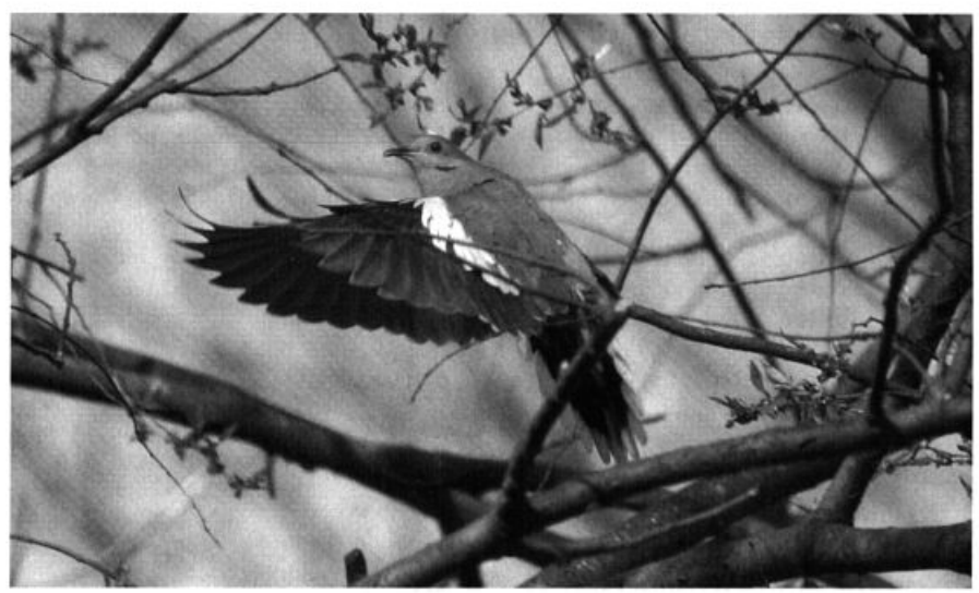
White-winged Dove has become an annual visitor to New England. This beautifully photographed individual visited a feeder in Watertown, Massachusetts from 22 April (here) through 1 May 2005.