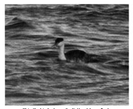
This Clark's Grebe at Owl's Head State Park. Maine was a state first and just the third for the East Coast.

Eastern Seaboard (the other records are from Virginia and North Carolina).