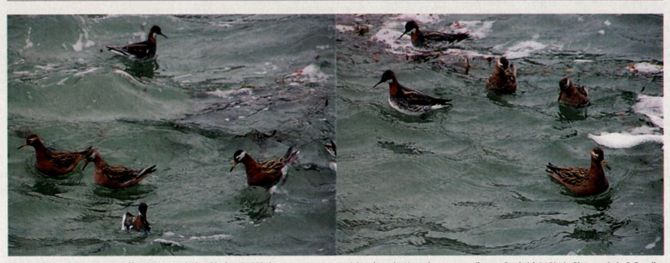
During the howling nor'easters of late May 2005, Red and Red-necked Phalaropes were common sights along the Massachusetts coast (here at Sandwich 26 May).