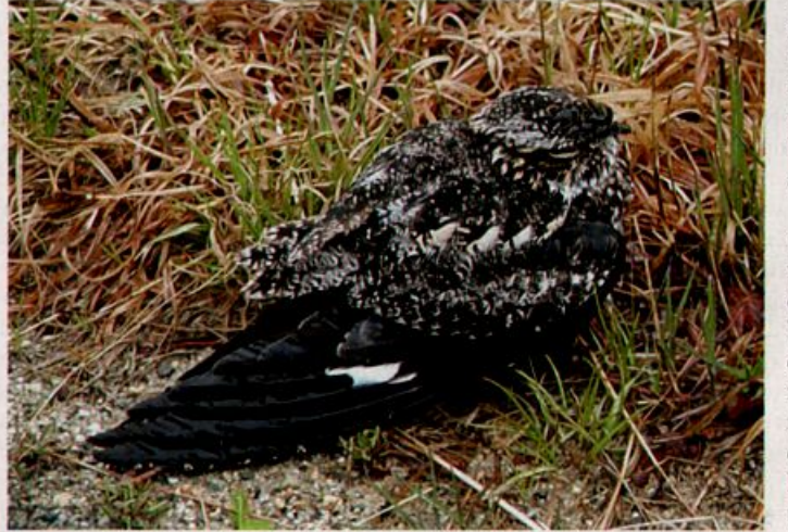
Figure 3. This Common Nighthawk 30 April 2005 at Plum Island, Massachusetts raises the question: were the many early arrivals documented in spring 2005 "overmigrants," simply carried northward on southerly winds, or were they rather indications of a strengthening trend toward earlier arrivals, an effect of a warming climate? And, likewise, were the many extralimital southern warblers and other passerines in New York and New England in spring 2005 "overmigrants"—or would-be colonizers, simultaneously expanding their ranges northward? And what connection to climate change might they have?

In compiling interesting observations from the spring season, we spent hours poring through the regional reports and noting in a spreadsheet those observations of particular interest, along with the reason for notation. In this listing of hundreds of records, we found that a fairly substantial percentage