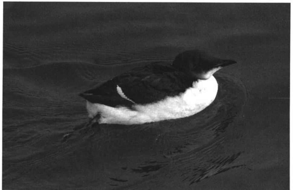
An exploratory inshore boat trip along the northern New Jersey coast 29 January 2005 turned up a record four Thick-billed Murres within 400 meters of shore. This individual sat for its portrait about 100 meters from the shore at Long Branch, Monmouth County, New Jersey.