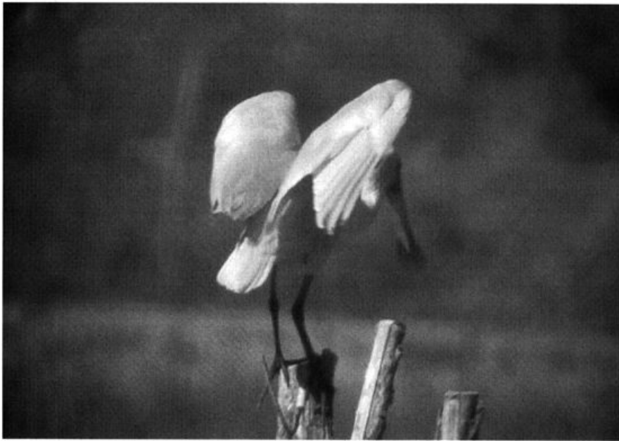
This immature Roseate Spoonbill, present at Chaparral, Doña Ana County 25 (here 27) August–4 September 2004 provided New Mexico's seventh record overall but the fourth since 2002.