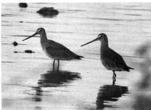
Always a pleasure to discover in the Middle Atlantic, these Hudsonian Godwits were at Great Oak Pond, Kent County, Maryland 25 (here 27) October–1 November 2004.