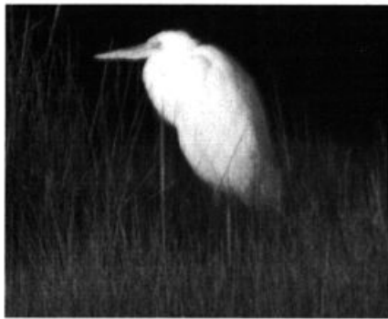
This Great White Heron at the 42nd Street Marsh at Ocean City, Worcester County 14 November 2004 provided only the second record of this subspecies for Maryland.