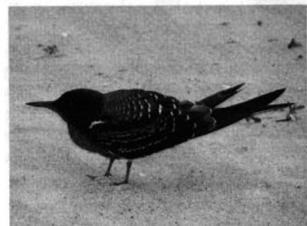
This Sooty Tern—grounded at Assateague Island, Worcester County, Maryland 9 September 2004—was courtesy of the remnants of Tropical Storm Frances . It was one of two reports of the species associated with that tropical system in the Middle Atlantic Region.

Eurasian Collared-Doves are becoming increasingly expected in areas around Tidewater and on Virginia's Eastern Shore. A pair in