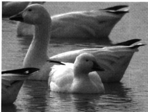
Regional birders are careful when studying smaller Chen geese to attend to the pitfalls posed by hybrids. This apparent Ross's Goose x Lesser Snow Goose was at Great Oak Pond, Kent County, Maryland 2 November 2004.