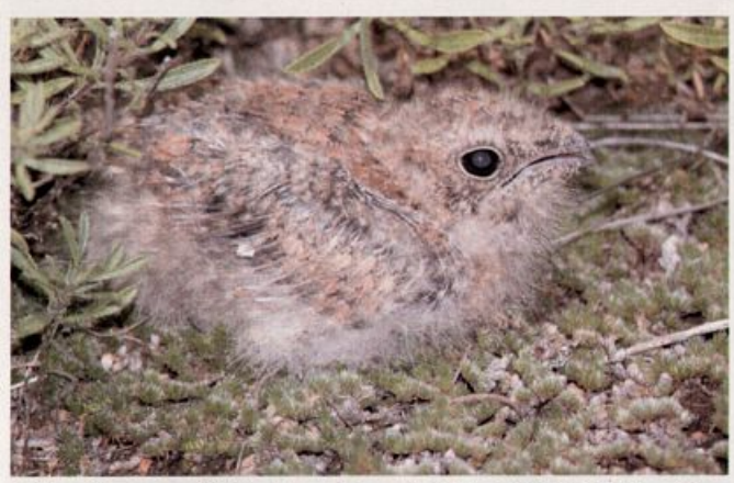
This nestling Common Nighthawk was photographed 27 June 2004 at Wichita Mountains Wildlife Refuge, Comanche County, Oklahoma, where its coloration precisely matched the colors of the local soil.