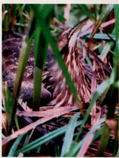
At Squaw Creek National Wildlife Refuge in Holt County, this female American Bittern was at one of two nests found 9 June 2004, the first nests found in Missouri since 1986.