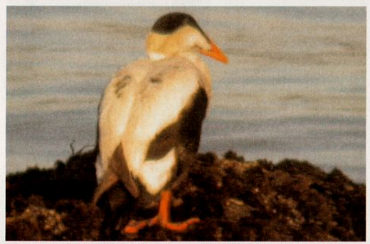
A first state record long expected—if not in summer—this molting adult male Common Eider of the declining western race v-nigra spent 5–18 (here 6) July 2004 in Crescent City, Del Norte County, California (shown here at Pebble Beach). No Common Eider had ever been found on the West Coast south of British Columbia, though another (or the same?) male Common turned up in August 2004 in Port Angeles, Washington.