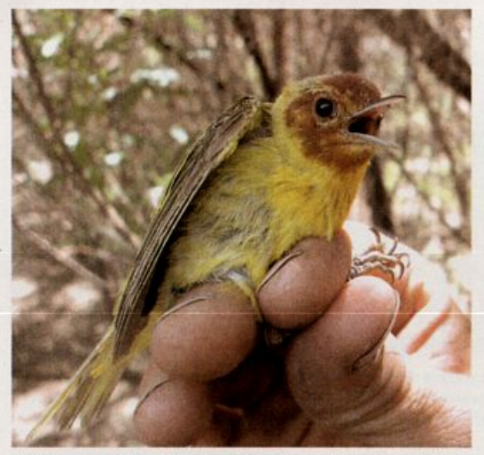
This worn male Yellow Warbler of the erithachorides ("Mangrove Warbler") subspecies group was netted near Roosevelt Lake in central Arizona 31 July 2004, representing a first Arizona record of this usually sedentary form that is normally restricted to mangrove habitat. The nearest area of regular occurrence of this species is coastal northern Sonora, Mexico.