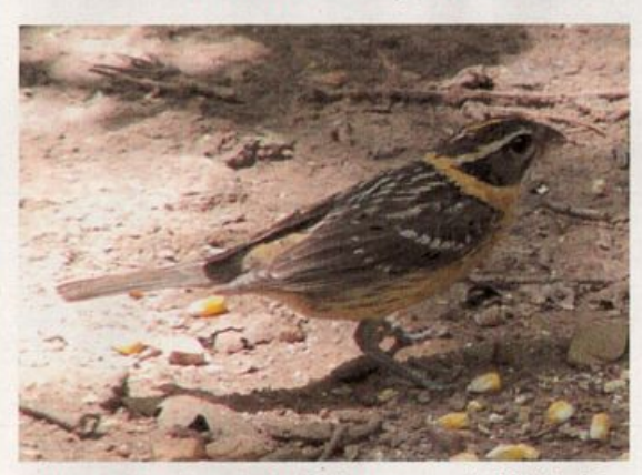
Central Oklahoma has only a handful of summer records of Black-headed Grosbeak, among them this adult male in Edmond, Oklahoma County on 27 July 2004.