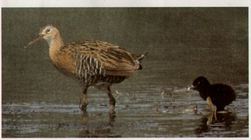
This adult King Rail with one of its three chicks was photographed at Prairie Oaks Metropark, in Franklin County, Ohio 27 July 2004. The species is listed as Endangered in Ohio and as a species of "Highest Continental Concern" by the American Bird Conservancy.