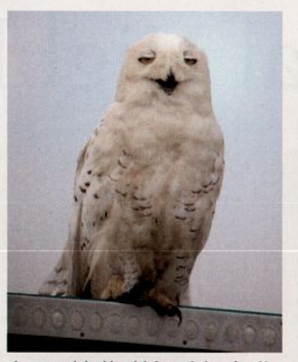
An apparently healthy adult Snowy Owl was found in rural Indiana 15 (here 31) July and remained through 15 August 2004, when it was struck and killed by a vehicle. Such a summer record is without precedent for the state.