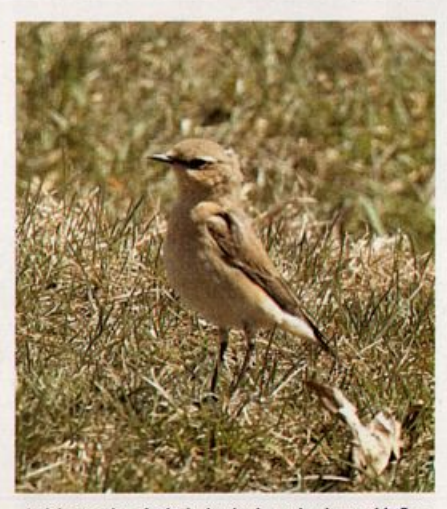
Arriving too late for inclusion in the spring issue, this fine photograph of a Northern Wheatear was taken 21 April east of Lake Champlain in the town of Georgia, Vermont, one of few recorded south of the Arctic in spring 2004.