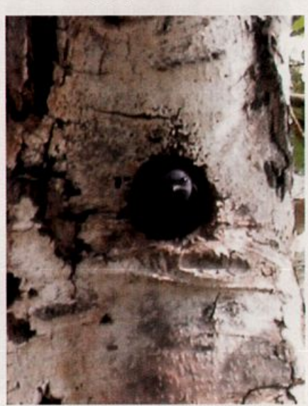
A male Purple Martin peers out of one of two nests cavities found in the Sierra Madre Mountains in southern Wyoming on 21 July 2004. Breeding martins had not been found in Wyoming since the 1930s.