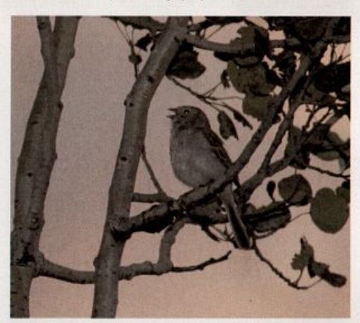
Field Sparrows show up infrequently in southern Manitoba, which is just north of the species' breeding range. This bird was on territory near Lauder from 16 through at least 24 July (here) 2004 and was seen by many.