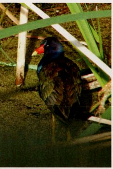
This Purple Gallinule graced the Jordanelle Wetlands, Wasatch County from 24 to (here) 27 July 2004—only the third documented in Utah and the first in 65 years.