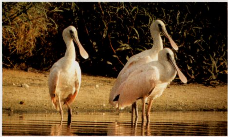
These three Roseate Spoonbills graced a golf course pond in northwestern Tucson, Arizona, here photographed 23 July 2004, the last day of their two-day visit. The species is a casual visitor to the state, almost certainly from the Gulf of California.