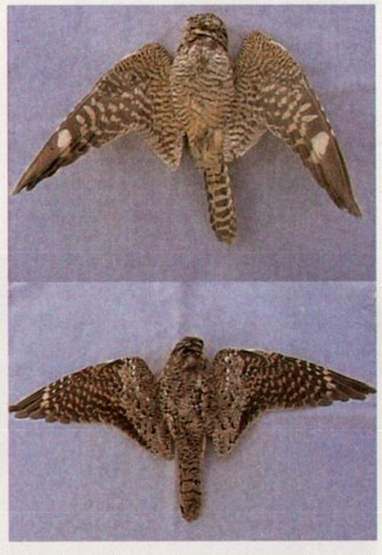
This female Lesser Nighthawk specimen collected at a men's correctional facility in Gilmer, West Virginia 28 April 2004 represents a first state record and one of few extralimital records away from Gulf Coast states and the southern Great Plains—Ontario and Alaska have the only other confirmed records well out of range.