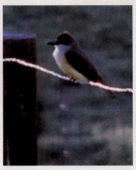
This Thick-billed Kingbird was found at a private residence outside of Parker, Douglas County, Colorado on 3 June 2004. The state's only previous record of the species is from 23 October 1992.