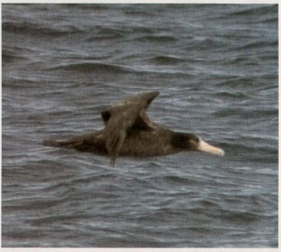
This juvenile Short-tailed Albatross appeared with a Laysan Albatross some 41.6 km off Westport, Washington, on 26 June 2004—the first of the species during summer there since 1889! Before feather hunters took their toll in the late nineteenth century, this species was a regular visitor off Washington's coast, often close to shore. Almost all recent records are from pelagic rather than littoral waters.