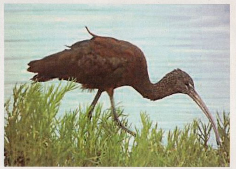
An apparent first-year Glossy Ibis at Freezeout Lake Wildlife Management Area 14–20 (here 19) July 2004 would provide a first record for Montana if accepted.