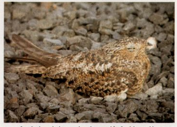
Constituting only the second nesting record for Guadeloupe, this Antillean Nighthawk with a single egg was photographed 13 June 2004 at Belle-Plaine.