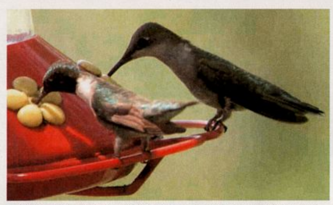
This female Magnificent Hummingbird photographed 11 July 2004 in rural Chautauqua County, Kansas provided the third record for the Southern Great Plains region; the species has been increasing as a vagrant out of range in recent years.