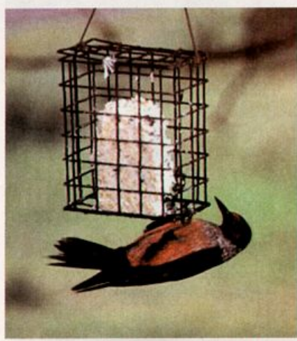
This Lewis's Woodpecker frequented a feeder in Pictou County, Nova Scotia 1 through 3 (here) July 2004; the only other record of the species in the Atlantic Provinces region is from Newfoundland, in early autumn of 1986.