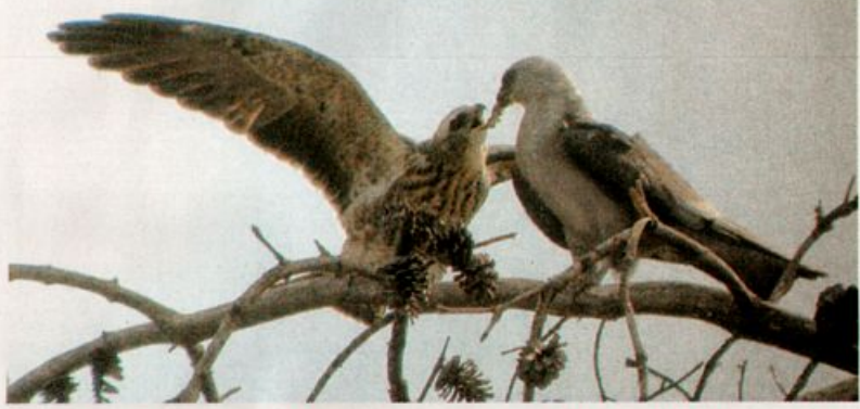
Previously unrecorded in Guilford County, North Carolina, Mississippi Kite made its county debut by nesting: three adults and two just-fledged juveniles were present to the northwest of Greensboro 29 July through at least 17 (here 6) August 2004. Though no nest was discovered, the nest was probably not far from this location.