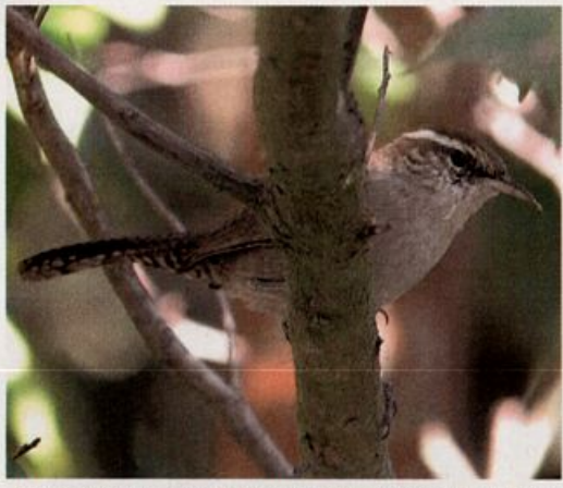
Extremely rare anywhere in Appalachia since the mid-1980s, Bewick's Wren was discovered nesting at Chickamauga Battlefield Park in northwestern Georgia between late May and early (here 6) August 2004. On 24 July, two adults were seen feeding two juveniles, for the first confirmed breeding in the Southern Atlantic Region since the early 1980s.