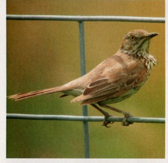
Indiana's first Sage Thrasher made a one-day appearance in Vermillion County on 5 July 2004. The species has been recorded out of range in the East and Midwest with increasing frequency lately.