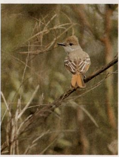
Ash-throated Flycatcher is a casual early-summer or late-fall vagrant along the southern coast of British Columbia. This individual, showing the diagnostic adult tail pattern, was photographed 18 June 2004 at Half Moon Bay.