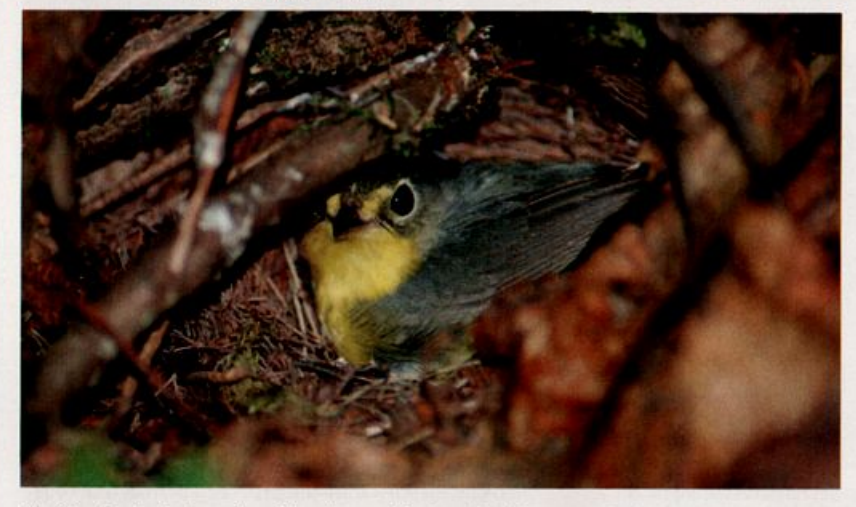
The Yukon Territory's first confirmed breeding record for Canada Warbler was provided by a pair nesting along the lower La Biche River (here 4 July 2004) in the southeastern part of the territory.