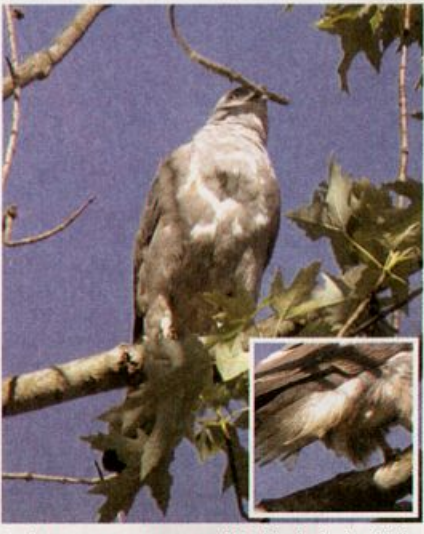
During past emergence years of Magicicada cicadas, Mississippi Kites have shown some extensions of summer range. This subadult female at Bull's Island, New Jersey (here 20 June 2004) was accompanied only by an immature bird, and no breeding attempts were recorded in the state. The birds fed heavily on the cicadas, though how cicada wings ended up set in the undertail coverts (inset) is unknown.