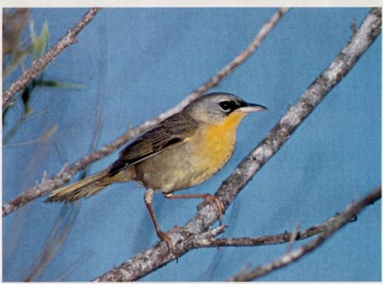
Maintaining a territory at the Sabal Palm Sanctuary, Cameron County, Texas from early February 2004 through the summer was this male Gray-crowned Yellowthroat, here photographed 11 July. During its stay, its vocalizations shifted from typical Gray-crowned song toward songs that closely resembled those of the nearby Common Yellowthroats.