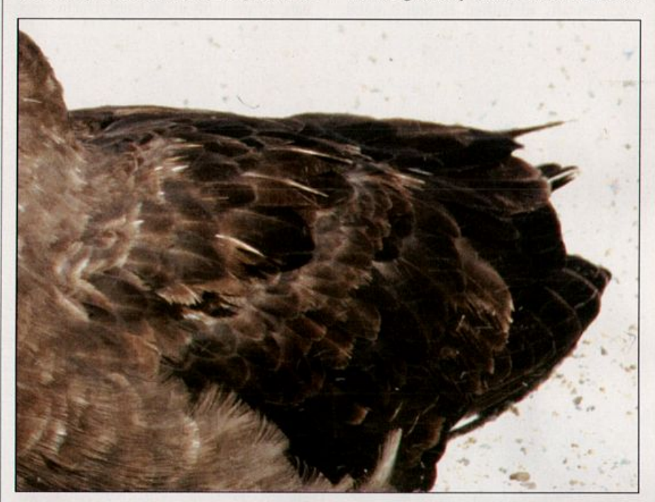
Figure 4. Wing area enlarged from Figure 1 and much brightened to highlight contrasting details. Note the apparently fresh primaries and secondaries, the mix of worn and fresh scapulars and coverts, the white, exposed shafts on some worn scapular feathers, and the lack of pale internal markings on fresh covert feathers.

The markedly rufous Chilean Skua, which also almost always has a strong cap, has never been reported in the North Atlantic and is ruled out on plumage, at least on present knowledge. However, nonadult plumages of Brown Skua are more difficult to distinguish from darker plumages of South Polar Skua (particularly presumed subadults). The blackish-brown wings do resemble those of South Polar Skua, but there was no hint in the field (nor in the photographs) of the pale nape and foremantle generally found in intermediate