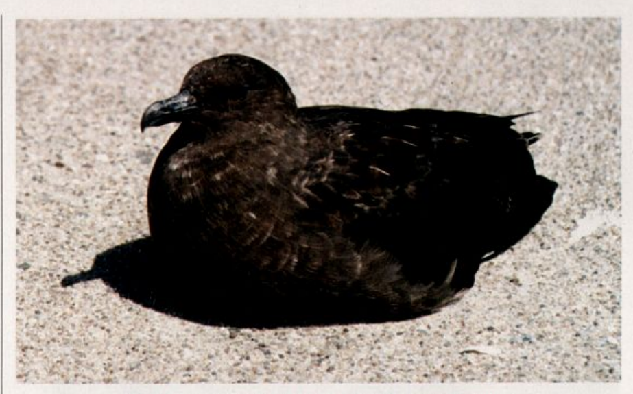
Figure 1. Skua on Sable Island, Nova Scotia, 13 May 1996.

In the eastern North Atlantic, Brown Skua has now been confirmed twice: on the Scilly Islands, 7 October 2001 (Scott 2002) and in Glamorgan, 3 February 2002 (Moon and Carrington 2002). The identification of these skuas from mitochondrial DNA did not exclude the possibility of either being a hybrid with paternal South Polar Skua, but this was deemed very unlikely from population estimates and morphology (Votier et al. 2004). There are no other confirmed records of Brown Skuas from North Atlantic waters, but more may come from the eastern Atlantic Ocean off Senegal, where only Great Skuas had been thought to occur. Numbers from that region have been photographically identified as South Polar