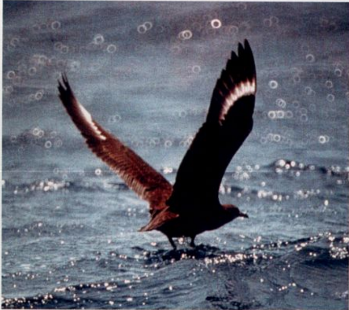
Figures 6, 7. This large skua, tentatively identified as a juvenile Brown Skua, was observed off North Carolina's Oregon Inlet 29 May 1993. The tones of plumage were uniformly deep, warm brown with a ruddy cast in some parts (especially the coverts), very different from the colder tones and gray cast of juvenile South Polar Skua. The uniformity of color and freshness of plumage, as well as the shape of the remige tips, indicate a juvenile skua, but spring date rules out juvenile Great Skua and rules in a skua of the Southern Hemisphere. Its overall dimensions—particularly the heavy body, large, deep bill, and long legs—appeared too robust for South Polar Skua to the observers and perhaps even heavier than Great Skua, thought to be mostly a winter visitor to these waters. Other suspected Brown Skuas have been observed 1992—2001 in North Carolina waters, but none has been proved.