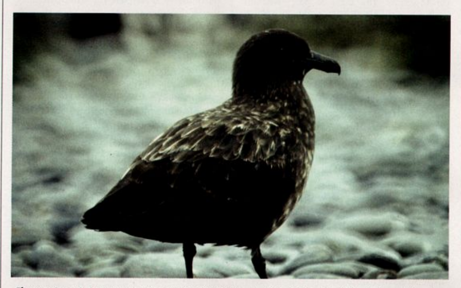
Figure 8. Brown (Subantarctic) Skua ( S. a. lonnbergi) at Grytviken, South Georgia Island, South Atlantic Ocean, 2 December 1995. South of Elephant Island and north of Palmer Station on the Antarctic Peninsula, Subantarctic Skua hybridizes with South Polar Skua. Some hybrids resemble Brown Skuas in the field, enough so that identification of vagrant Brown Skuas must rely on morphometric or molecular data, at least on present knowledge.