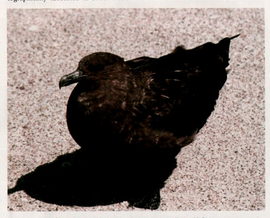
Figure 2. Skua on Sable Island, Nova Scotia, 13 May 1996.

The lack of strongly rufous tones below or