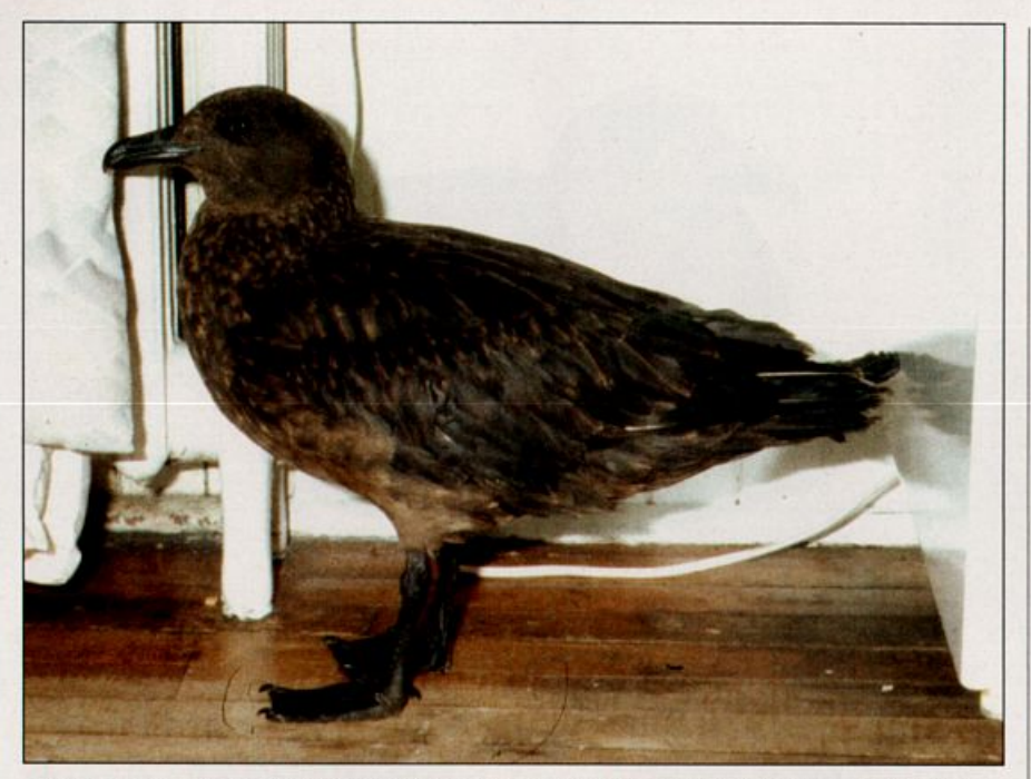
Figure 3. An apparent intermediate or pale/intermediate juvenile Great Skua, captured by Lucas on Sable Island, Nova Scotia, on 2 January 1995 and brought to the mainland for rehabilitation. Note the dark hood, tawny underparts, and pale rufous markings within covert feathers, all typical of juvenile Great Skuas (but see text).