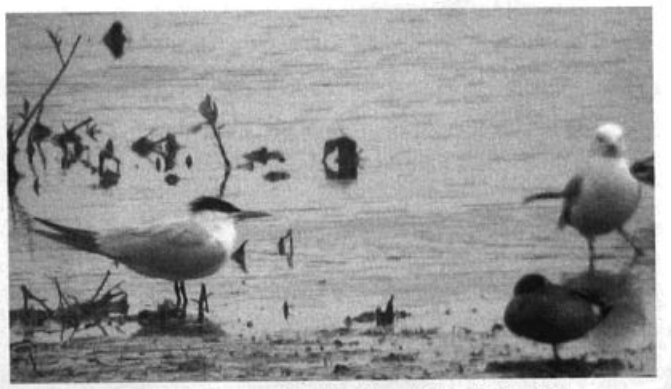
Furnishing only the second record for Colorado, this adult Royal Tern delighted observers at Big Johnson Reservoir, El Paso County, Colorado from 16 June 2004 (here) through 20 June 2004.