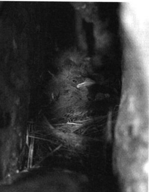
Discovering a Brown-capped Rosy-Finch nest anywhere is sure to be memorable, but this nest above South Gap Lake in Wyoming's Snowy Range, found 10 July 2004, was apparently the first ever found in Wyoming. The nestlings were banded 15 July, when this photograph was taken.

It was a good sparrow season throughout much of the Region, with several species w.