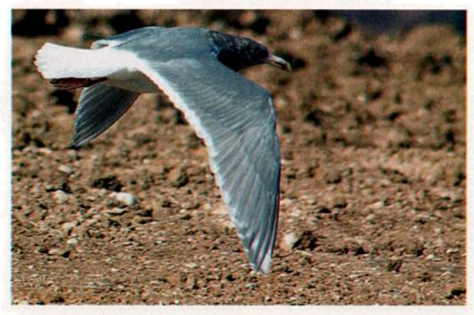
This Glaucous-winged Gull at Fort Worth, Tarrant County, Texas 6 (here) to 8 January 2004 provided the first record for the state. Glaucous-winged Gulls are notorious for hybridizing with other large gull species, but this flight portrait shows the detail of the primaries clearly: neither too much nor too little dark pigmentation for Glaucous-winged. The rich brown vermiculated hood is also typical of winter birds. Aside from records of the species in Morocco and the Canary Islands (perhaps the same individual), this bird represents the most extralimital record of the species confirmed to date. Photograph by Martin Reid.

Thayer's Gulls, usually firstwinter birds, are rare winter and spring visitors to coastal Texas. This bird at the Elliott Landfill, Corpus Christi 4 March 2004 was in its second winter, a plumage never previously documented in the State. The patterns of wing and tail are too dark for a Kumlien's Iceland Gull, but this plumage is highly variable, with some birds as palewinged as Iceland, others as dark as Herring Gull. Photograph by Martin Reid.