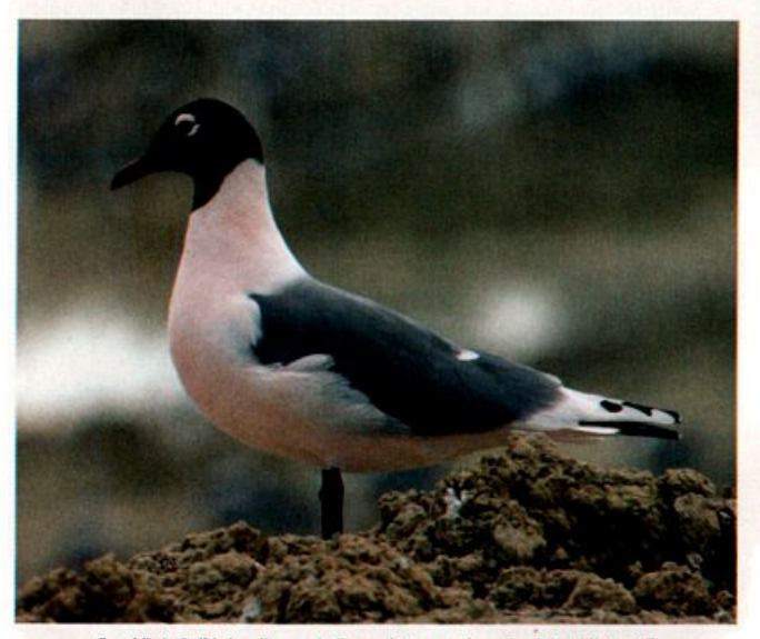
Franklin's Gull is hardly rare in Texas, but a newly arrived Franklin's Gull at Corpus Christi, breast blushed with rose, on 9 April 2004 is a sure sign of spring's arrival.