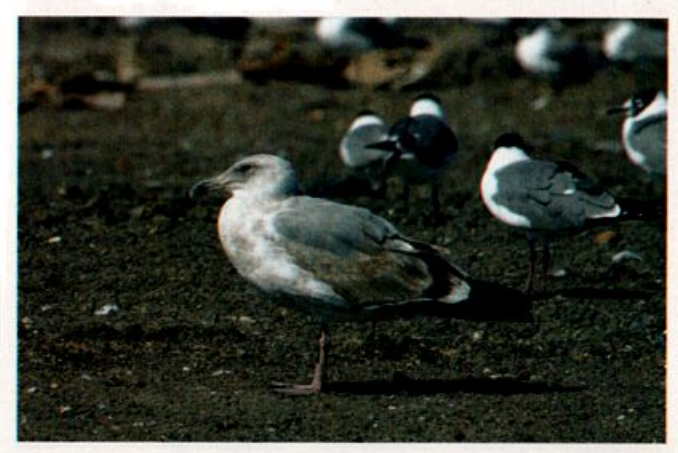
At Elliott Landfill, Corpus Christi 14 February (here) to 8 March 2004, this large gull shows characters consistent with a hybrid Glaucous-winged Gull x Western Gull hybrid, often called "Olympic Gull" or "Puget Sound Gull": the short wings, large, heavy-tipped bill and large head, darkish mantle, and overall size are right for occidentalis Western Gull, but the vermiculated breast and slightly paler-than-expected mantle suggest admixture of Glaucous-winged genes. Occasionally documented in the Great Basin and Rocky Mountain states, this bird represents the "easternmost" record for this hybrid thus far. Another was documented in winter 2003–2004 in Colorado.