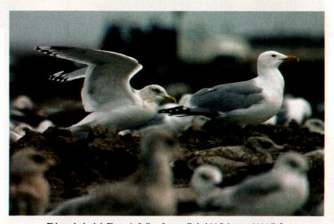
This typical adult Thayer's Gull at Corpus Christi 28 February 2004 (left, with adult smithsonianus Herring Gull) was one of few adults ever satisfactorily documented in Texas.