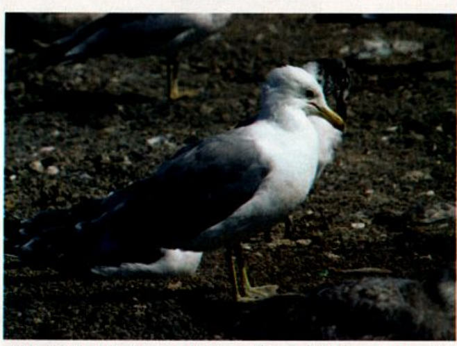
California Gulls of both subspecies, californicus and albertaensis, have been documented in Texas. This bird photographed at Corpus Christi 7 February 2004 shows the rather dark mantle typical of the nominate race—yet another western gull taxon documented in the state in winter 2003—2004. Another westerner rare in Texas, Mew Gull, has become an annual to the Fort Worth area; two were noted there in winter 2003—2004.