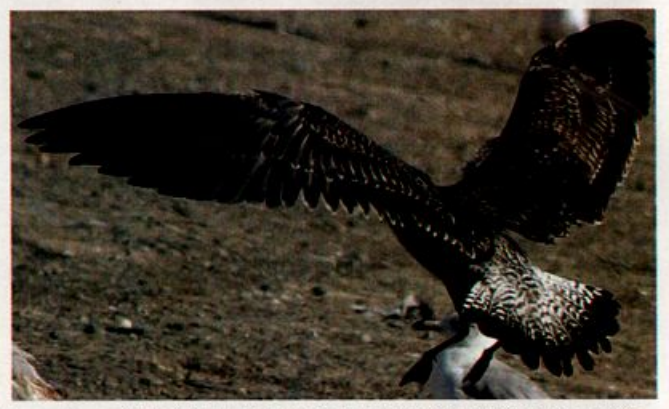
In flight, the remiges of the apparent michahellis (lower left and center images) appear blackish brown above, with the "window" (paler webs of inner primaries and outer secondaries) is much less pronounced than seen in smithsonianus Herring Gulls. In contrast to a first-winter Lesser Black-backed Gull at Elliot 9 March 2004 (bottom-right image), the greater secondary coverts are not uniformly dark but patterned brown and white (some Lesser Black-backeds can approach this pattern). The mostly white tail with sharply contrasting black tailband contains limited dark markings in the outer webs to outermost rectrices. The tailband is a useful mark—typically wider than seen in Caspian Gull (Larus cachinnans cachinnans/ponticus) but less extensive than in Scandinavian Herring Gull (Larus argentatus argentatus). Compare the variable but darker tail of first-winter Lesser Black-backed (at right); the tail of smithsonianus Herring Gull is more uniformly dark.