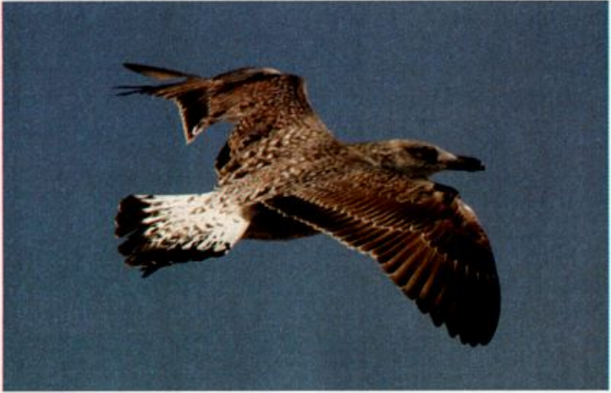
This first-winter Yellow-legged Gull (Larus cachinnans michahellis/atlantis; top two images), judged by European gull experts to be a close match for the subspecies atlantis, was located 24 January 2004 (left) at Corpus Christi's Elliott Landfill and remained through at least 3 April (right). In shape, the species is intermediate between Lesser Black-backed and Herring Gulls, with upperparts showing plumage palest in the mantle and scapulars, darker in the lesser and median coverts, with darker primaries and tertials a bit darker than the coverts. The bird's head was generally paler than first-winter Lesser Black-backed Gulls photographed at Corpus Christi (see more images at <www.martinreid.com>), more like a first-winter Great Black-backed Gull, with the paleness of the breast and belly also recalling Great Black-backed.