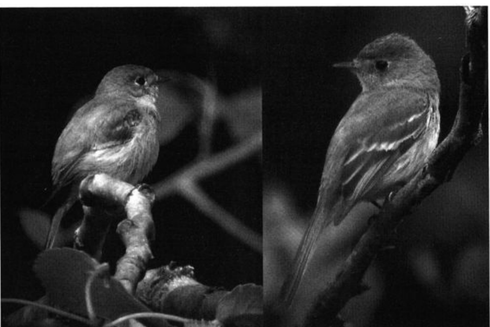
This Dusky Flycatcher (right) along the Salmon River at Hyder, Alaska 30 May 3004 provided one of only a few documented records for the state. Compared to the Hammond's Flycatcher photographed at Hyder on the same date (left), the Dusky has a shorter primary projection, a longer-tailed appearance, and a longer, flatter bill.

Siberian Rubythroats arrived roughly on time, with a single at Attu 29 May and another there 30-31 May (LS, JL, PP), one on St. Paul I. 30-31 May (St. Paul, FGI), and a peak of 9 on Shemya 1 Jun (MTS). Rare and local in S.E. in early spring, Mountain Bluebirds were prominent at Pt. Bridget n. of Juneau, with a single flock of 26 on 16-17 Apr (MS, PS) and of 9 to the s. at Eagle Beach 15 Apr (BA, PS). Singles or small groups are more typical in spring, and the species is missed in S.E. some years. An SY Gray-cheeked Thrush was rare in S.E. in the Hyder thickets 4 Jun (SCH, GHR, TT), about a 3rd local record there. Swainson's Thrush was widespread early in the Region, initiated by a local record-early bird in Ketchikan 14 May (AWP). Most Swainson's arrive in numbers in the coastal zone late in the 3rd week of May. Eye-browed Thrush was reported only from Shemya, beginning with one there 30 May, a peak of 7 together