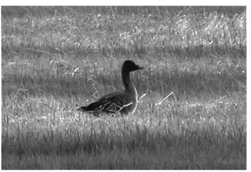
A rare spring migrant in the Bering Sea, this Bean Goose, possibly of the subspecies serrirostris, was at Contractor's Camp Wetland on Adak Island, Alaska 18 May 2004.

Gull reports were average to poor. A single first-summer Slaty-backed Gull at Kodiak 8 Mar (ph. RAM) was at a location where annual Oct-Mar; the winter season's Slaty-backed from Petersburg was last noted 9 Mar (RL). An ad. Sabine's Gull at Anchorage 1