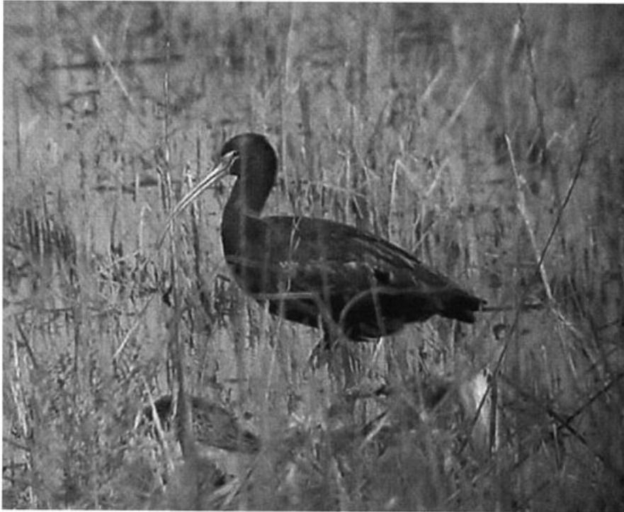
This Glossy Ibis found at Hackberry Flats Wildlife Management Area, Tillman County, Oklahoma 13 April 2004 was one of an increasing number of Glossies appearing in the Southern Great Plains region during early spring rather than summer.