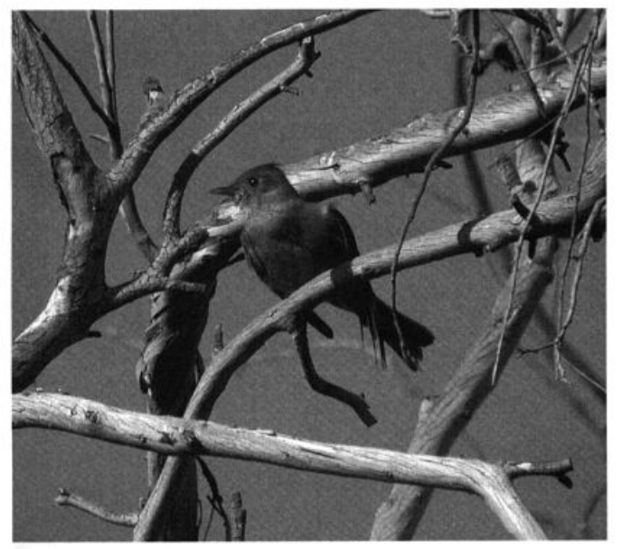
The first Greater Pewee for the Baja California Peninsula was found 27 January 2004 at the Mexicali Zoo.