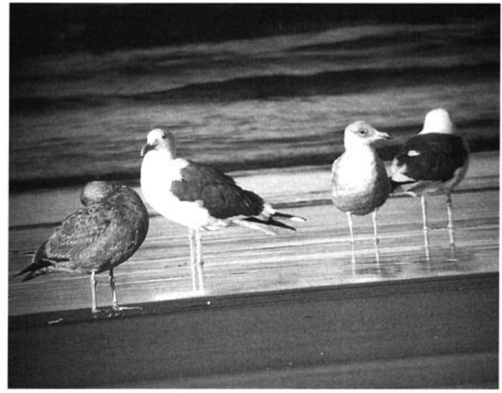
Though common in the Gulf of California, Yellow-footed Gulls are seldom seen on the Pacific side of the Baja California Peninsula. Limited data suggest, however, that small numbers may cross over regularly in southern Baja California Sur. This adult, photographed with Western Gulls on 9 February 2004, was the first to be found at Bahía San Quintín.