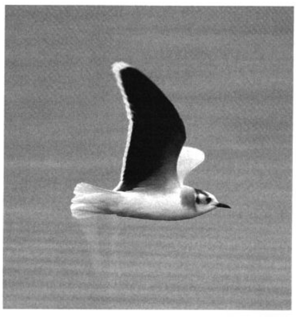
This adult Little Gull photographed at Prado Regional Park, San Bernardino County, California on 23 December 2003 was one of up to two present there between 21 December 2003 and 16 February 2004.

A Dusky-capped Flycatcher, a species casual in the Region, was in Fountain Valley 9 Dec–15 Feb (JEP), establishing the 11th winter record for Orange . Ash-throated Flycatchers, very rare in winter away from the se. deserts, were near Imperial Beach 22 Nov–10 Jan (GMcC) and at Prado Regional Park 14 Dec (HH). Expected were 4 Tropical Kingbirds along the coast during the