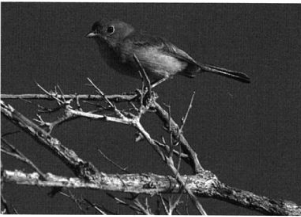
It was only in December 1999 that Gray Vireos were found to winter in California, so this photograph taken in Anza–Borego Desert State Park, San Diego County 6 December 2003 provides welcome documentation of it presence at this time of year.