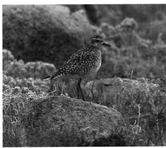
Pacific Golden-Plovers have overwintered regularly at only a very few locations in southern California in recent years, one of those being San Clemente Island, where this one was photographed 19 February 2004.

(n.) 14 Dec (AA) and up to 22 at Seal Beach 27 Dec–28 Feb (JFi) were the only ones known wintering along the coast. Hybrid American Oystercatcher x Black Oystercatchers were reported from Albert's Anchorage on Santa Cruz I. 15 Feb (DH), at White Pt. on the Palos Verdes Peninsula,