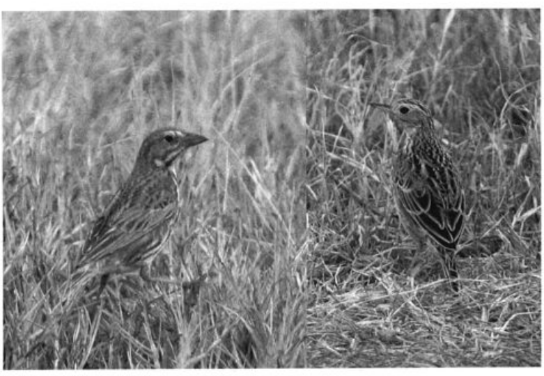
This Sprague's Pipit (right), one of four that overwintered in the area (into April), was photographed 14 February 2004 in a grassy field near Calipatria, Imperial County, California, about 14 kilometers east of the south end of the Salton Sea. This species had been considered casual in the Salton Sink. In the same vicinity on the same date was this Large-billed Savannah Sparrow (left); this subspecies is a regular winter visitor to the Salton Sea area but is normally only found near the shoreline.

Jan (DWA). A Townsend's Warbler in Indio, Riverside 6 Dec (SSw) was one of the few to be found in winter in the Salton Sink. A wintering imm. female Blackburnian Warbler near Imperial Beach was present 8 Dec–10 Apr (MSa, GMcC); there are very few winter records of this species in North America. An amazing 3 Grace's Warblers