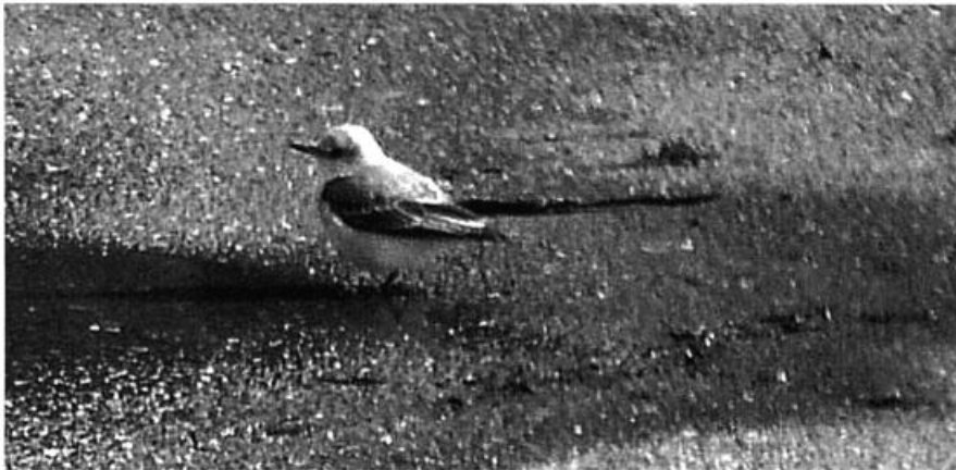
This Scissor-tailed Flycatcher at Pacifica, San Mateo County (here on 26 December 2003) was one of two found this winter in northern California.