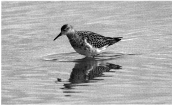
This Ruff, present 14–17 (here 15) February 2004 at Farmington Bay Wildlife Management Area, Davis County, provided Utah's third confirmed record of the species.